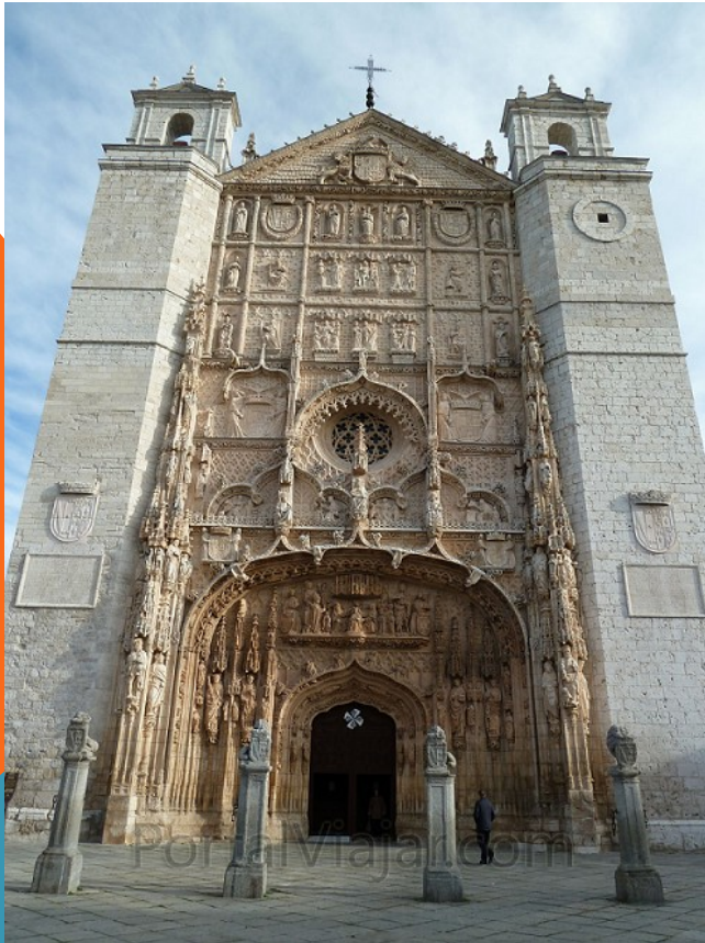
SAINT PAUL CHURCH