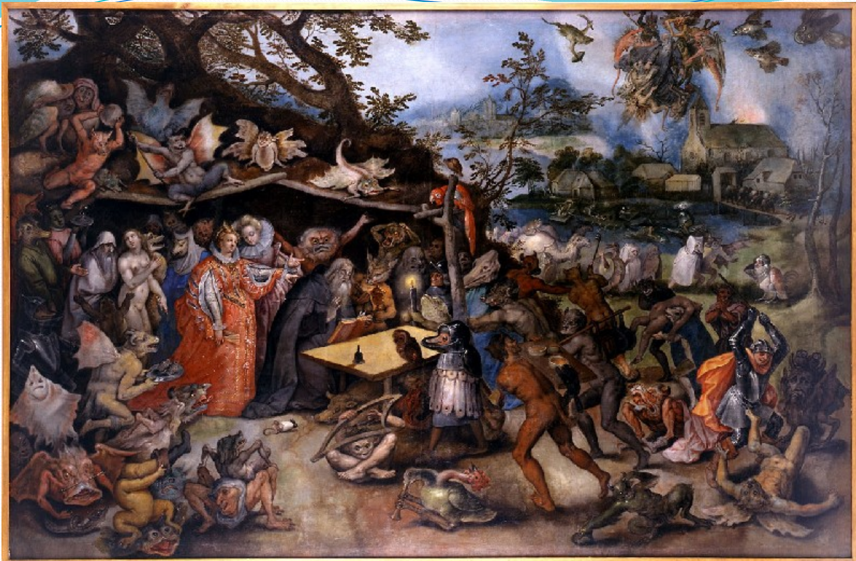
Temptations of San Antonio Abad by Jan Brueghel (first half of the 17th century)