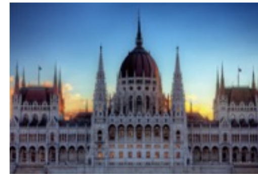
The Parliament of Budapest