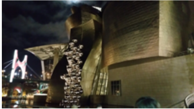
The city Bilbao