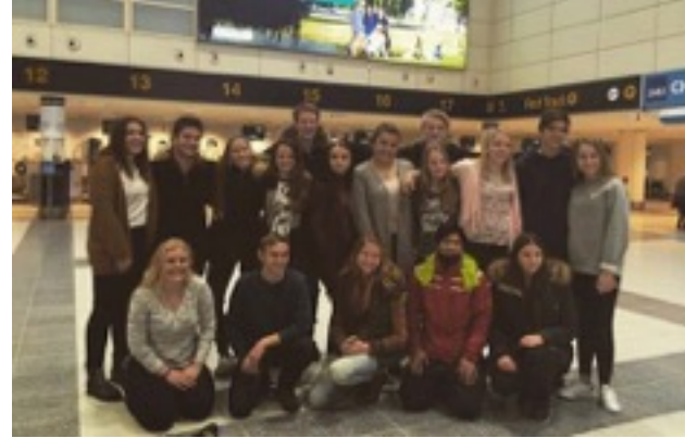
Our group photo at the airport