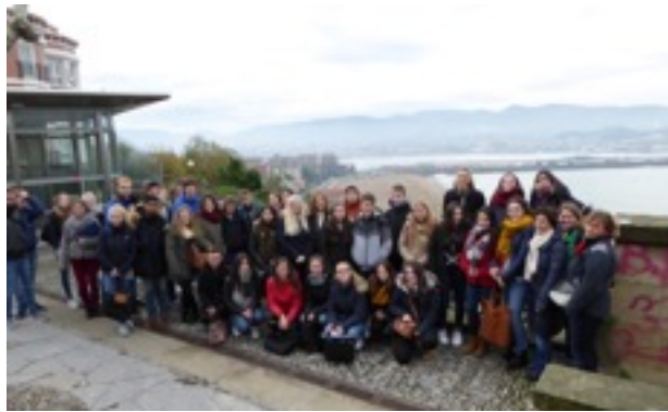
Our group photo in Bilbao