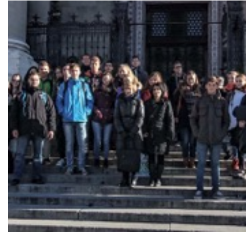
Our group photo in front of the Basilica