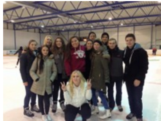
Ice skating as a free time activity