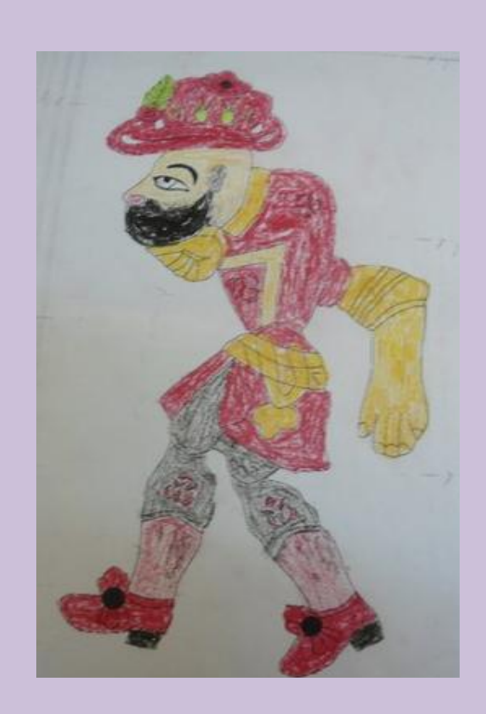
The Turkish Karagöz