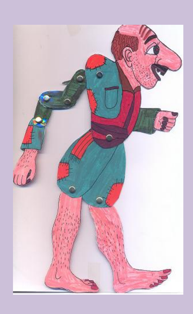
The Greek Καραγκιόζης