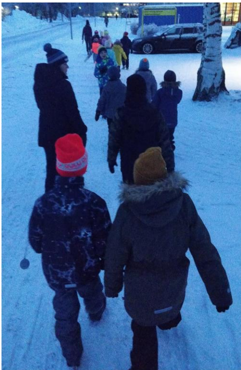
Trip to university