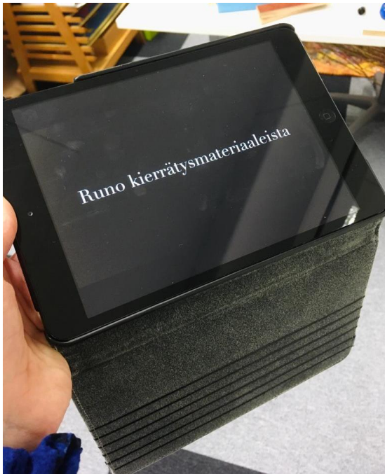
Poem about waste materials

recycling and get some real life examples about it.