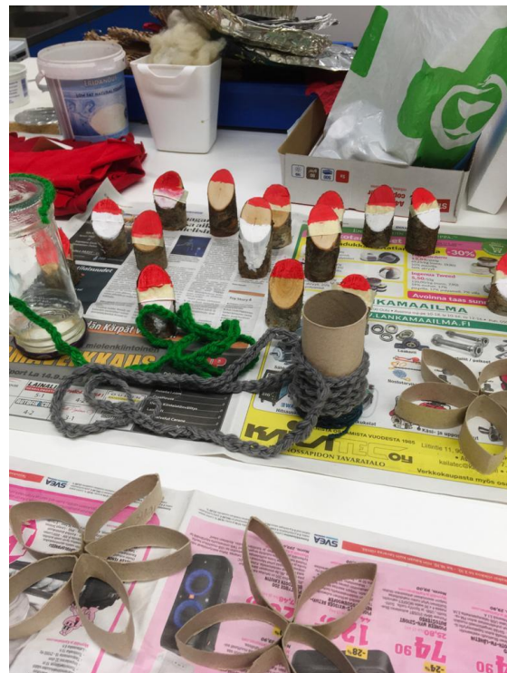
The elves from ecological material