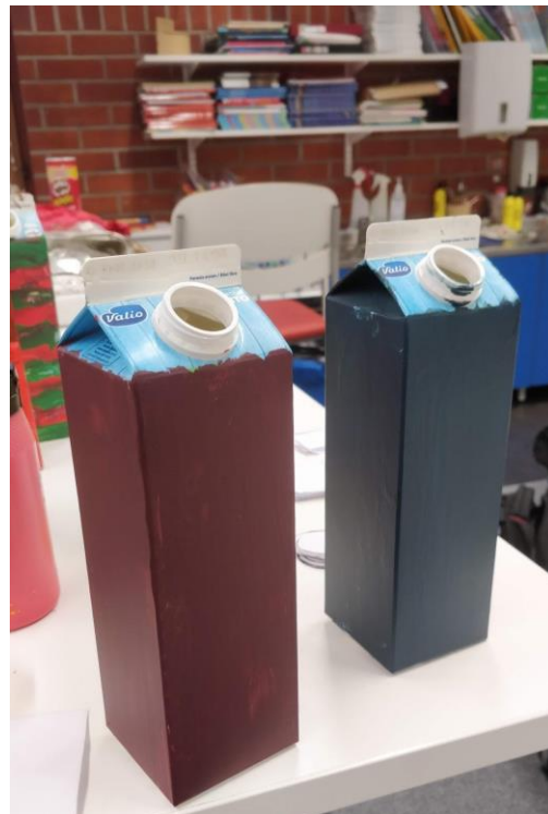
Recycled elves houses