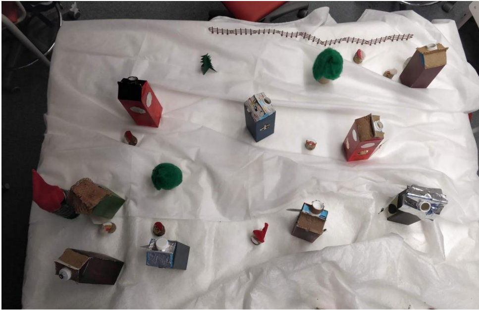
Part of a village for elves