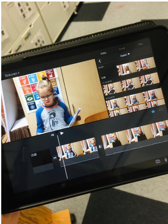
We made a movie of all videos