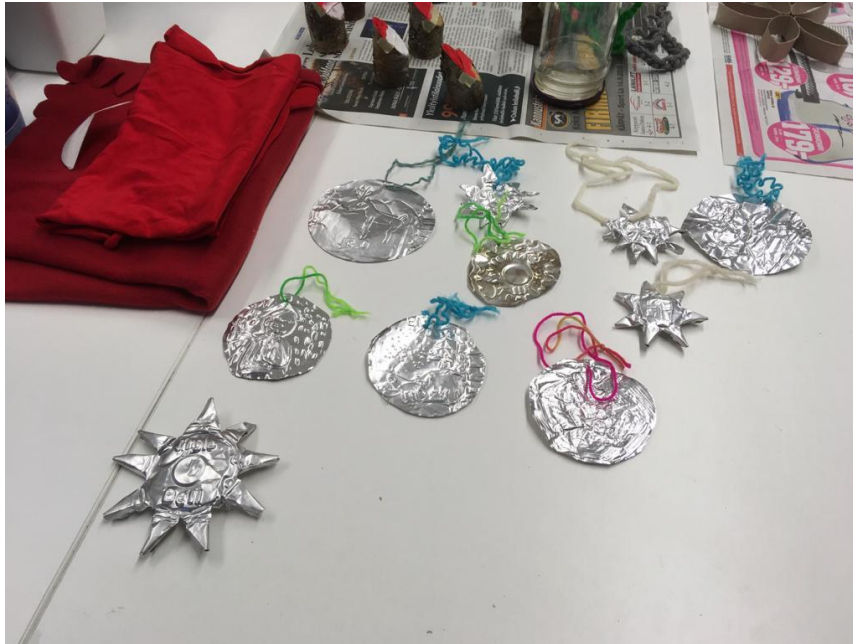
Christmas ornaments and stars made from waste material