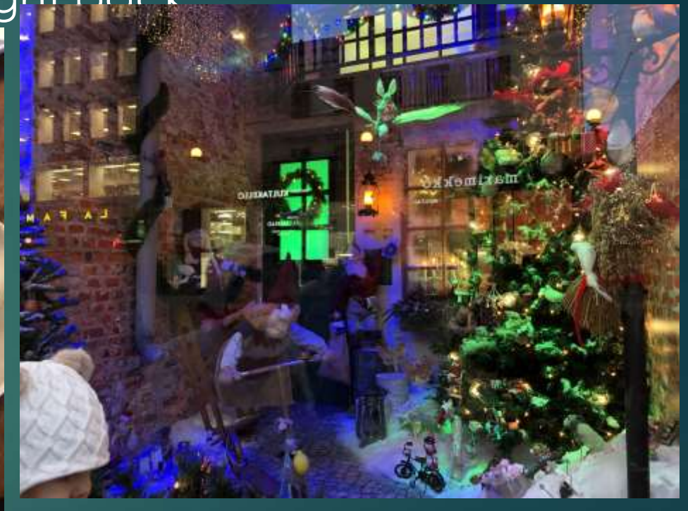
The Christmas shopping mall