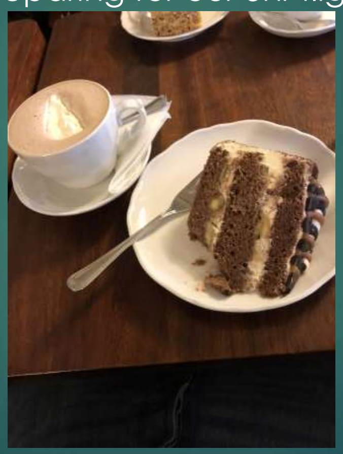
There local cheese cake

The catholic church and the small huts were suppose to be the Christmas market but it was closed and it will open on Friday the day we left