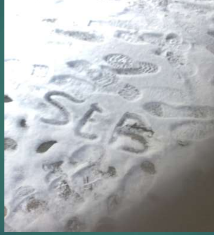
My name in the snow

A winder full forest of trees covered with snow