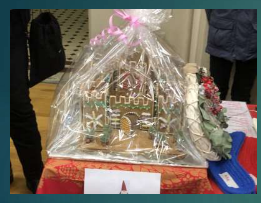
A ginger bread house was made so it would be at a lottery

on the second day we went to the school and there was a small party then after the party we went to the forest which was covered with snow