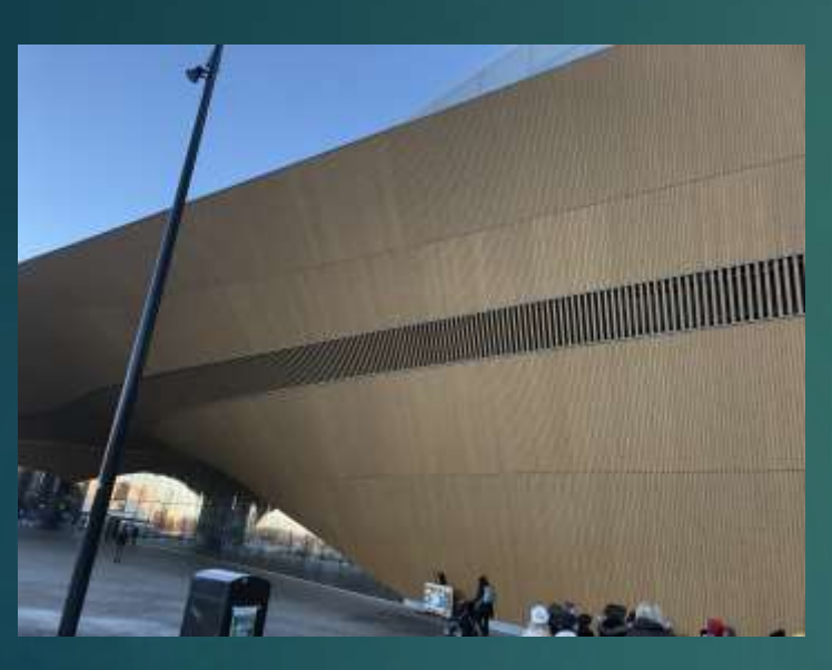
The library from the front