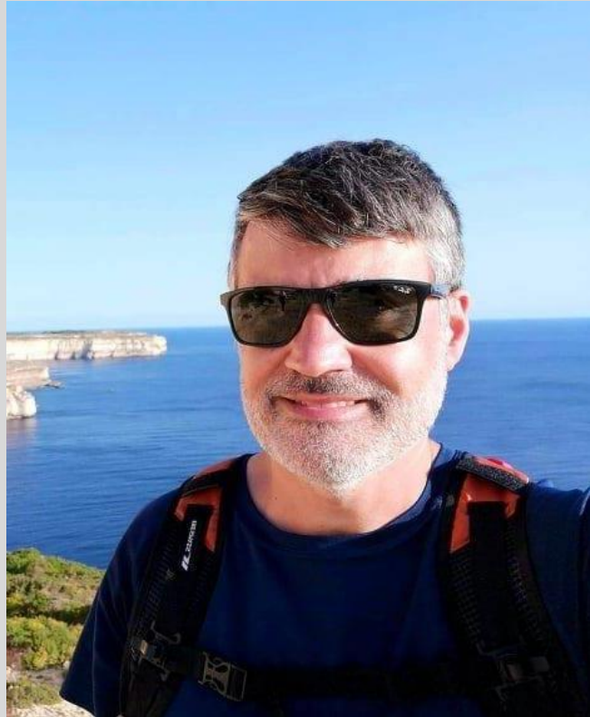
Jesmond Computing & ICT