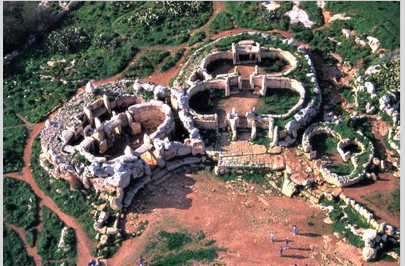
Ggantija Temples situated in Xaghra, Gozo dated between 3600 and 3200 BC