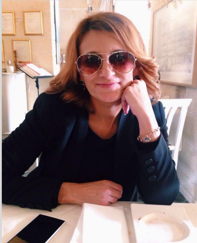
Joann European Studies