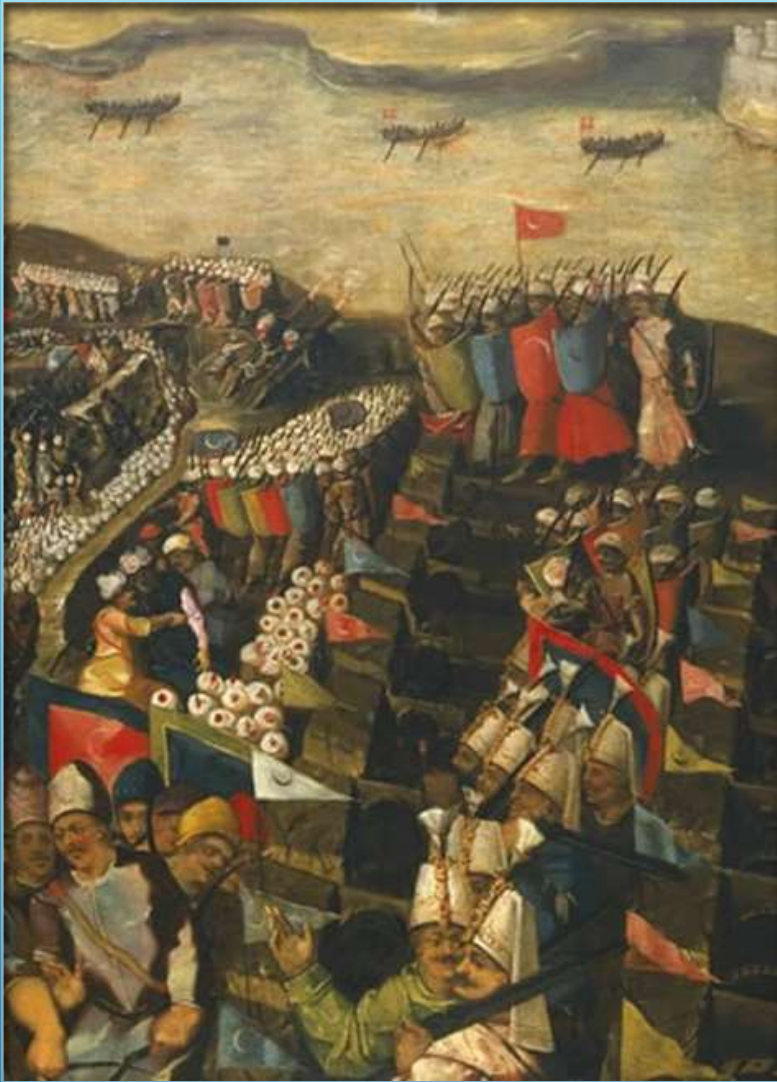
The painting shows the attack of Dragut in the 1551 battle