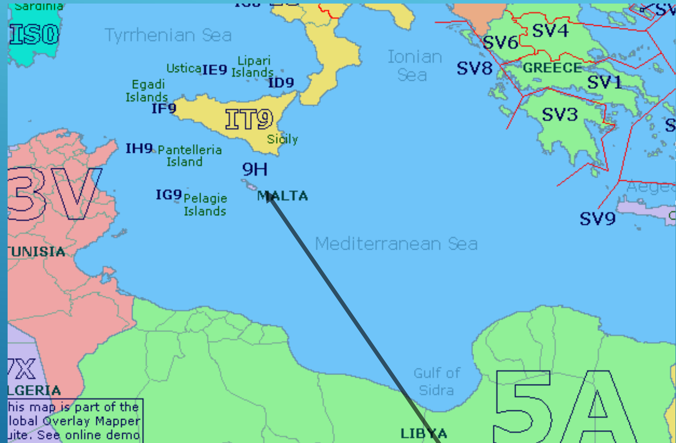
The Maltese islands