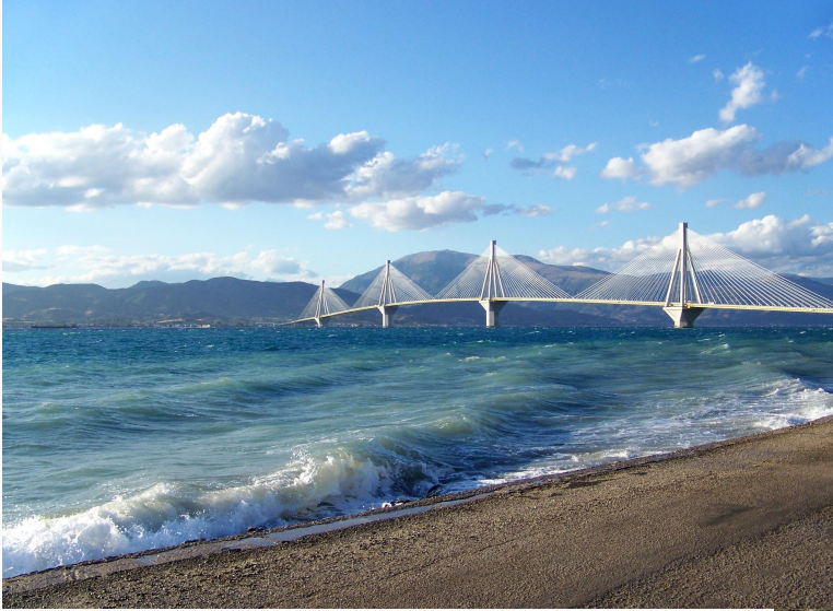
< Rion-Antirion bridge