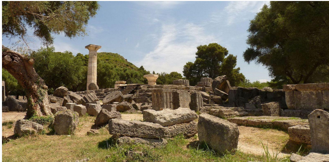
^ Ancient Olympia

In a few years olympia odos will get extended to kalamata in the south 250 km away from Patras. It will also pass from Pyrgos and Olympia.