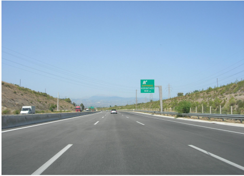
^ New road

Olympia odos is a brand new and modern motorway that replaced the old national road 8a which was really dangerous and there were usually a lot of accidents. With the new road the route Athens-Patras became safest and got decreased by two hours.