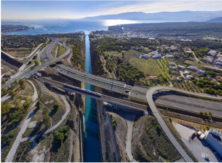
< Olympia Odos in Corinth Canal