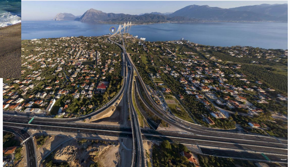
Major Junction of Rio, built in 2018 >