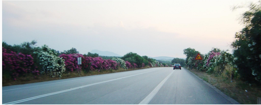
^ Old road