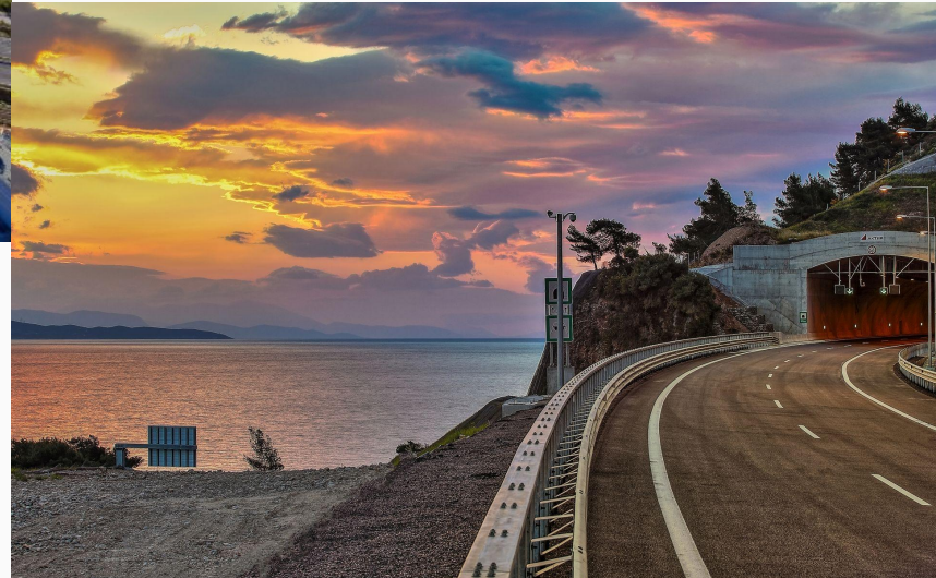
Tunnel in Kakia Skala >