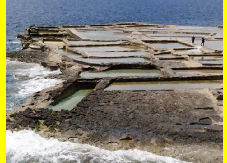
Delimara Salt pans