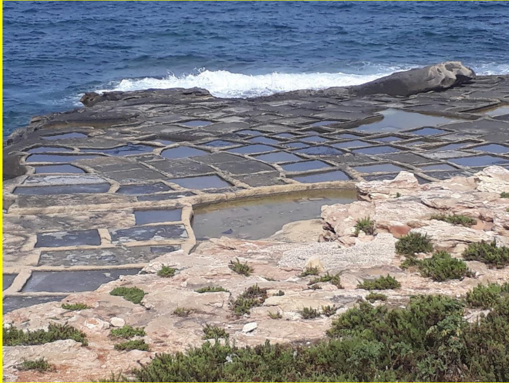
Marsascula Salt pans

Malta is surrounded by sea and so we use this natural resource to make salt