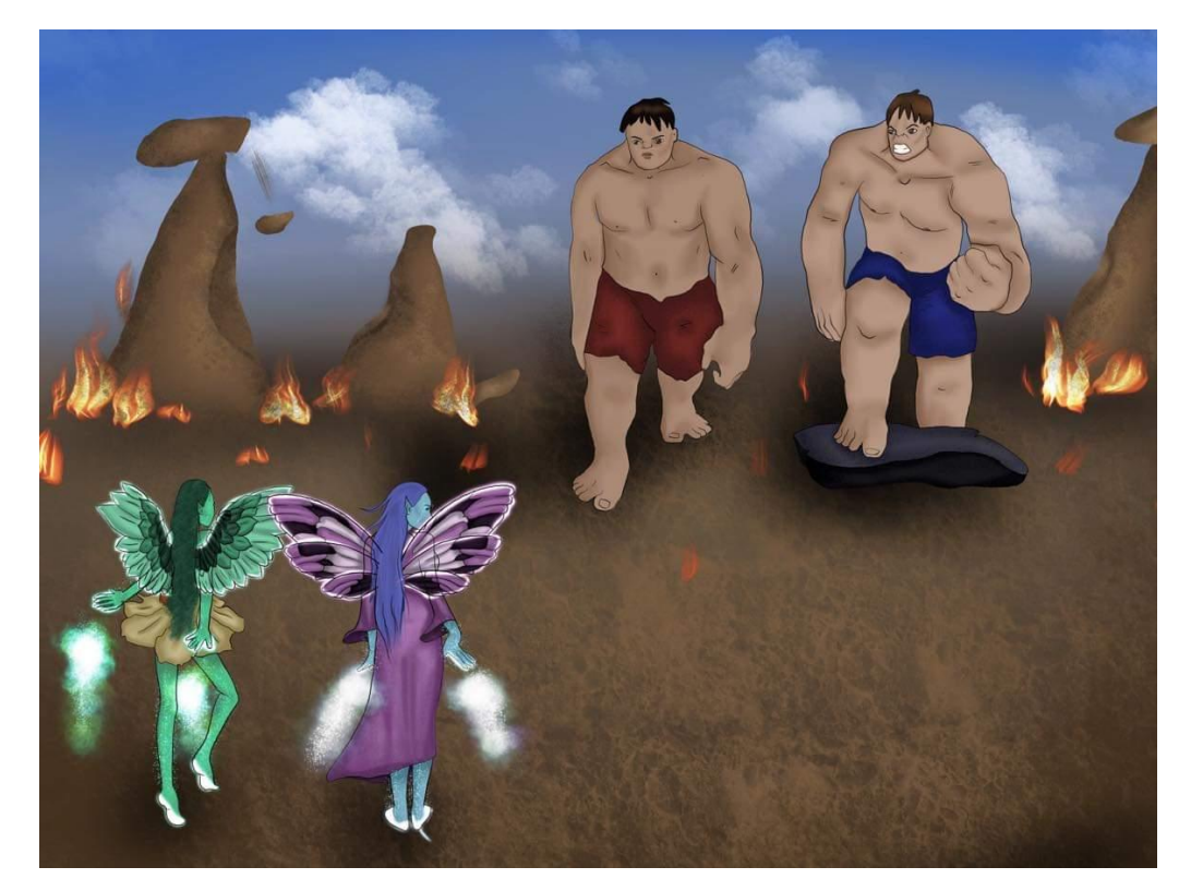
they flew to Cappadocia.

One day, the king of the fairies heard about these devil giants and wanted to help Cappadocia's King. Therefore, he gathered all his fairies and