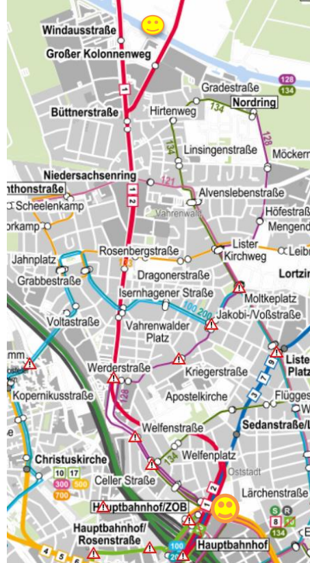
map section Großer Kolonnenweg-Main Station