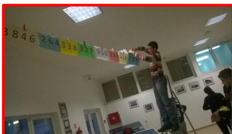
Installation of one hundred Pi-decimals