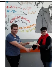
The winner of the Kahoot-Competition 1

According to project plans, World Math and Pi day were held in Industrial and trade high school, Croatia. In the school hall students set an installation of one hundred decimals of Pi. There was a competition in mathematical and logical questions on mobile phone in Kahoot!