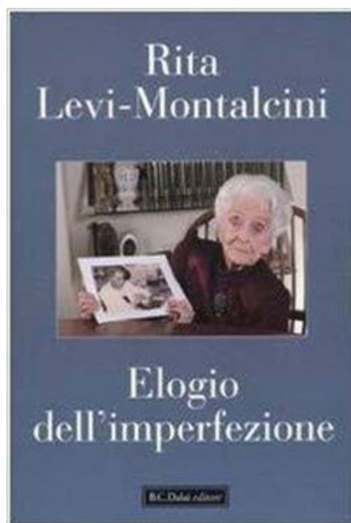
RITA LEVI MONTALCINI, 1987