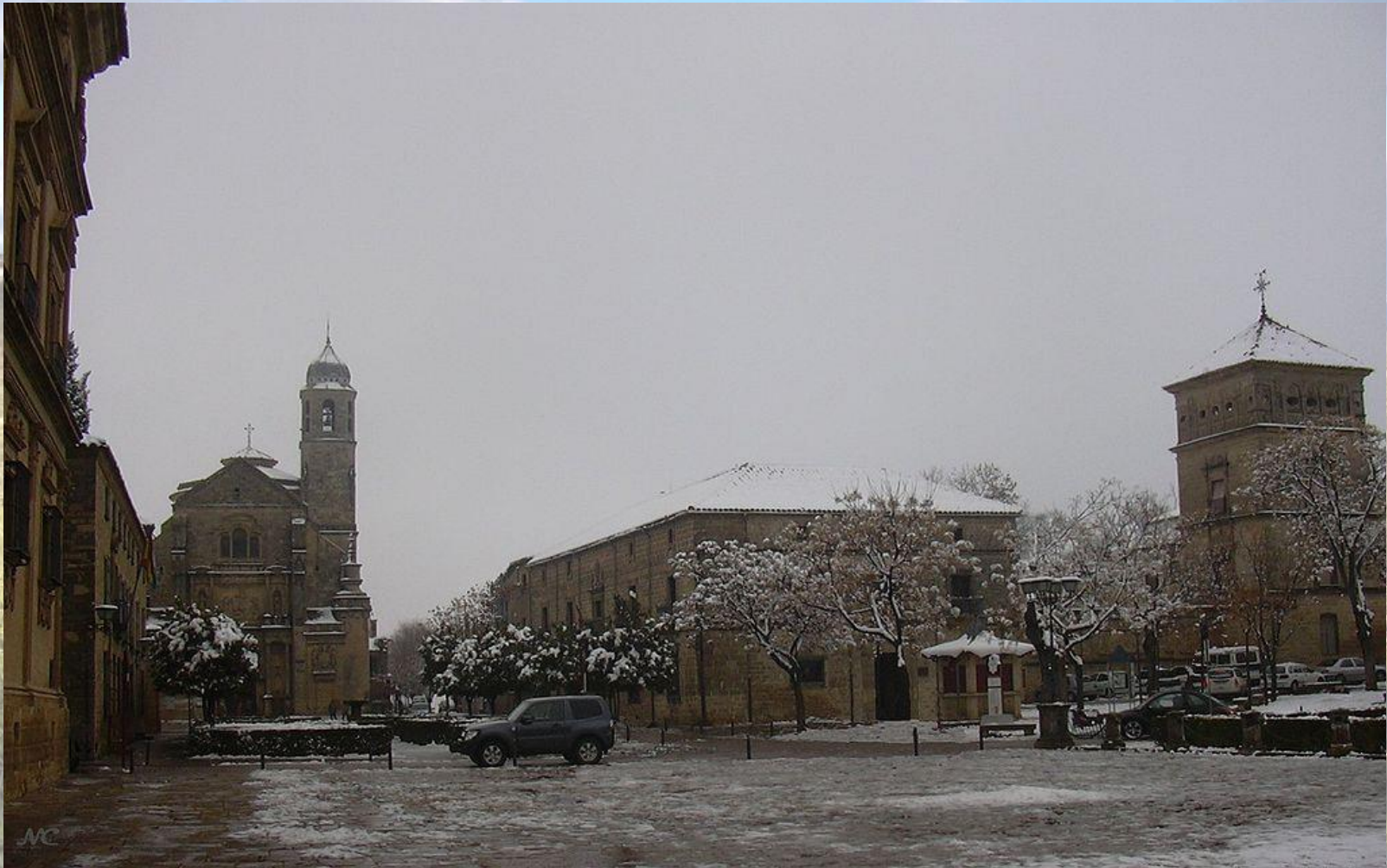
Vázquez de Molina Square, situated in Ubeda, in the Autonomous Region of Andalusia.