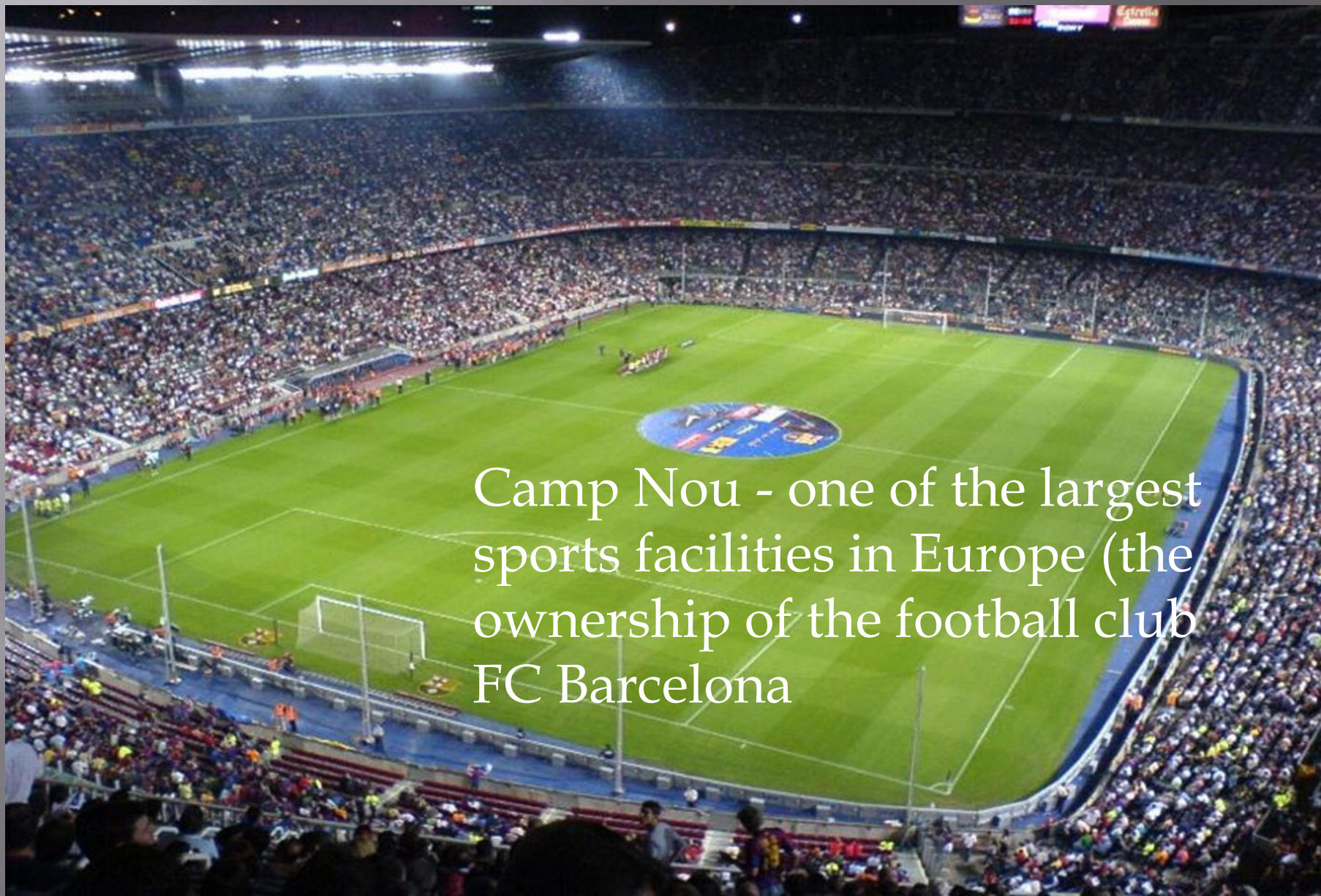
Camp Nou - one of the largest sports facilities in Europe (the ownership of the football club FC Barcelona)