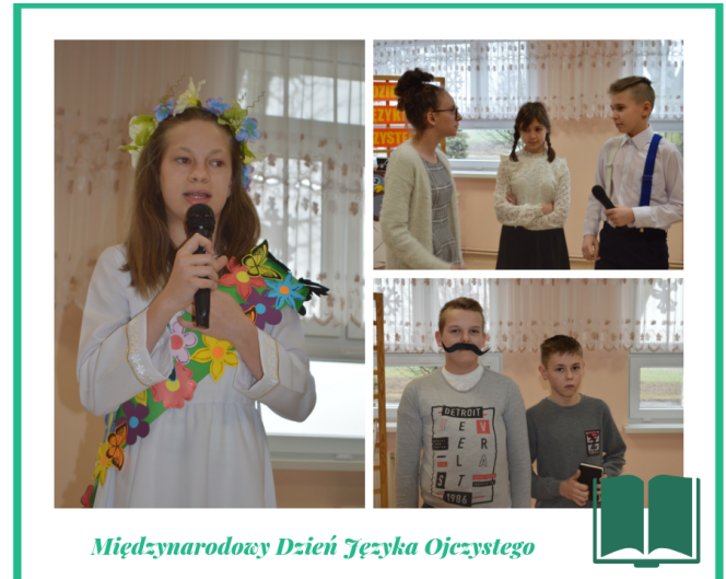
Międzynarodowy Dzień Języka Ojczystego