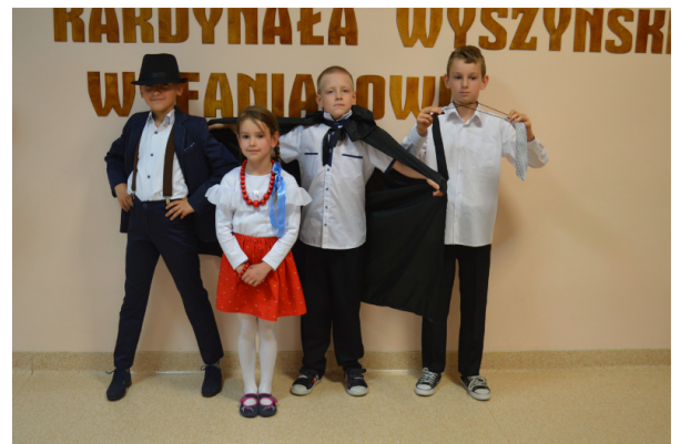
Włochy - Polska - Rumunia - Chorwacja

He loves the mountains, he loves the sea, the smell of flowers, the sea breeze, and most of all the creatures is the dog! what a dalmatian is called.