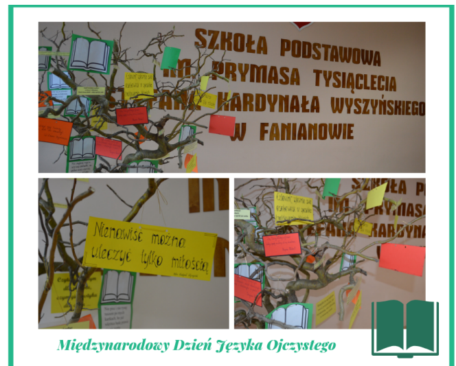
Międzynarodowy Dzień Języka Ojczystego