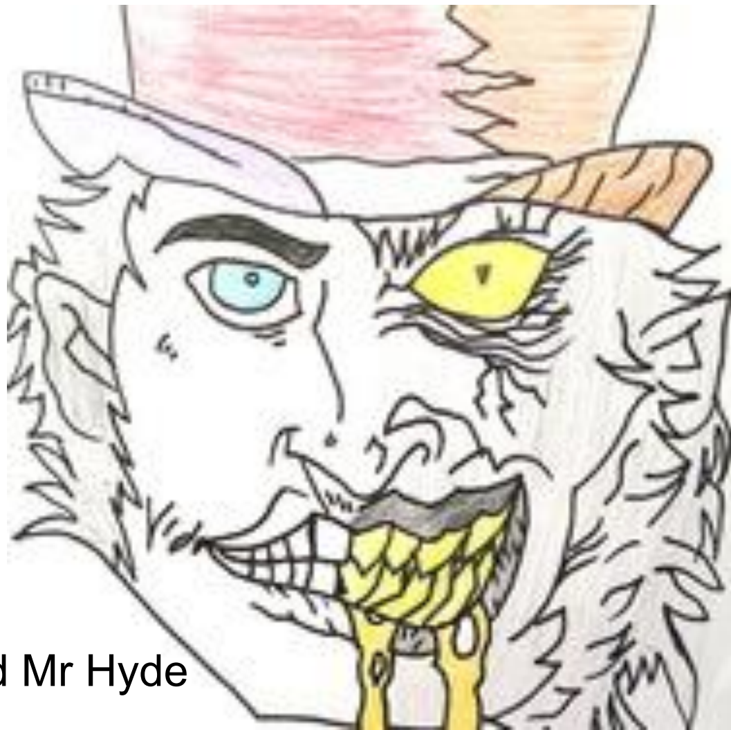
Dr jekyll and Mr Hyde