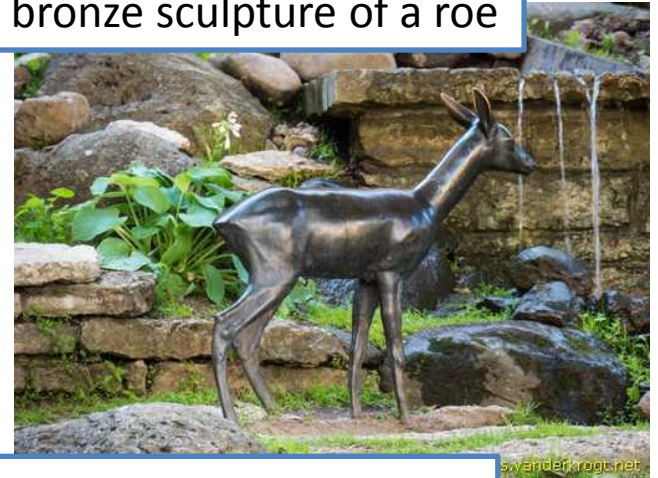
The bronze sculpture of a roe