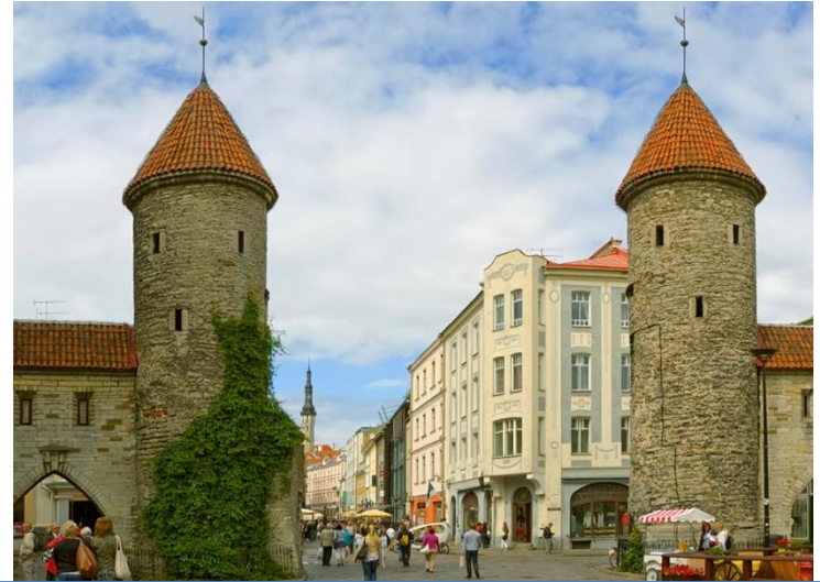
Viru Gate, entrance to the Old Town