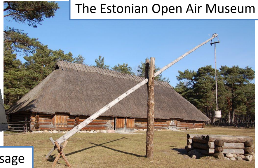
The Estonian Open Air Museum