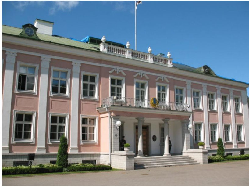
The Office of the President of the Republic of Estonia