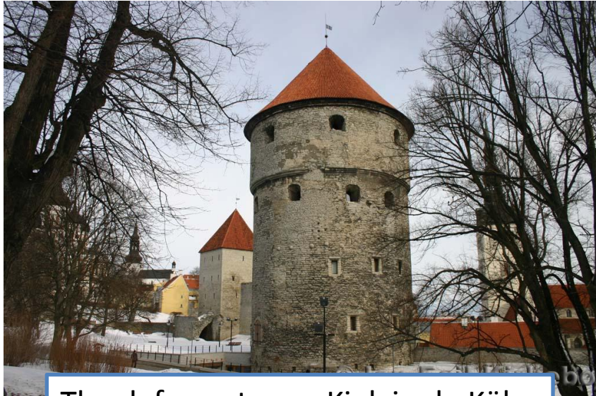
The defence tower Kiek in de Kõk