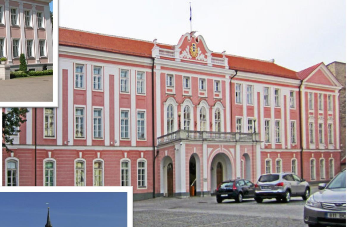
Parliament of Estonia