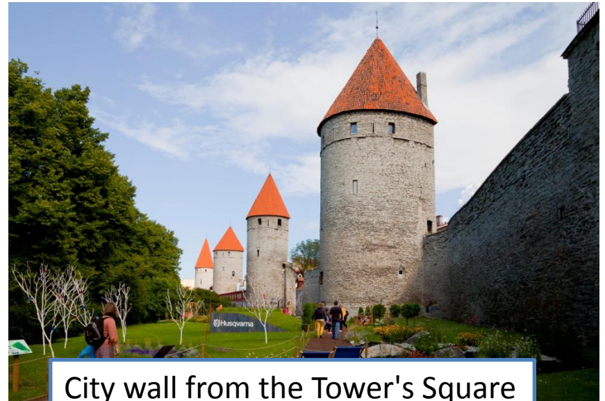
City wall from the Tower's Square