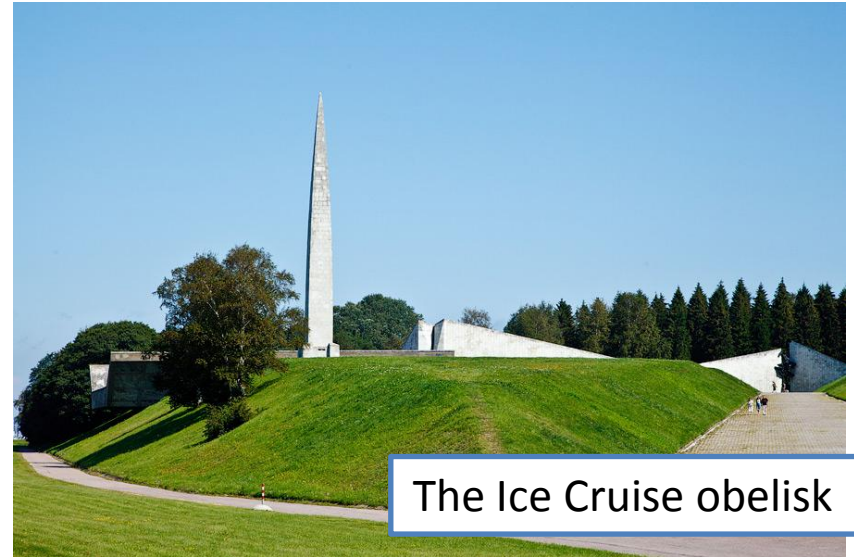
The Ice Cruise obelisk