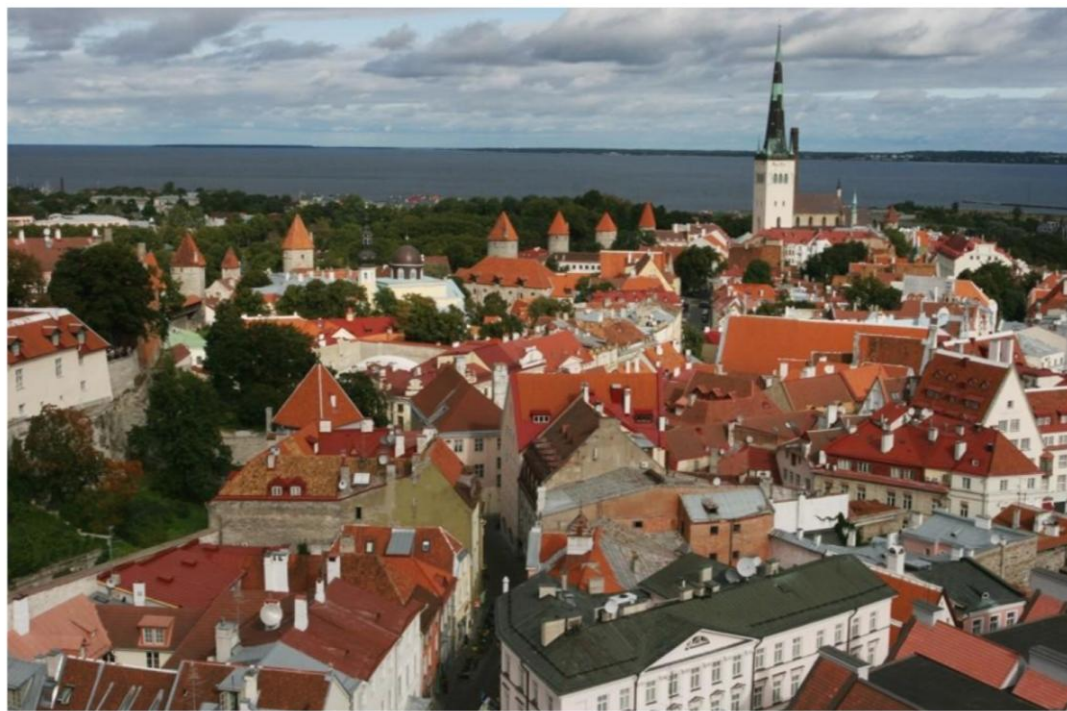
Tallinn centre over the Bay