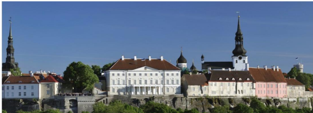
In the middle Stenbock House – the Seat of Government and the Government Office of Estonia