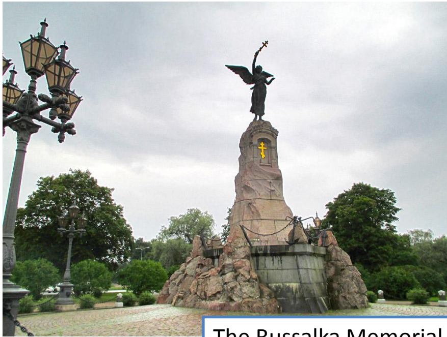
The Russalka Memorial