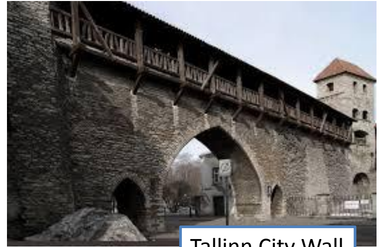
Tallinn City Wall