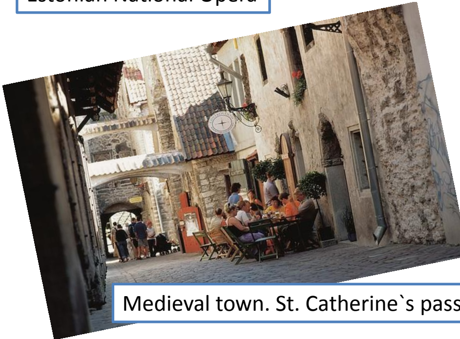
Medieval town. St. Catherine's passage