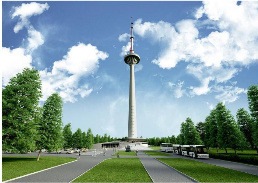
Tallinn TV Tower