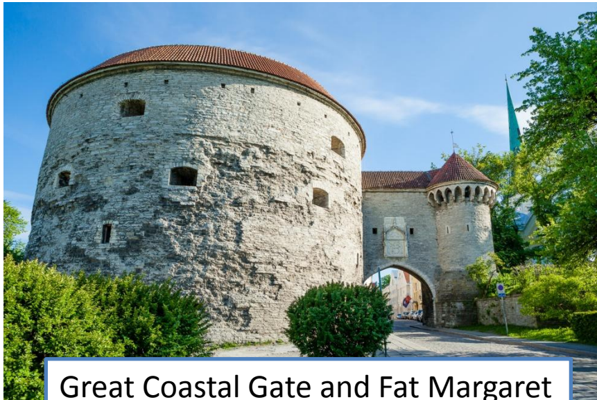
Great Coastal Gate and Fat Margaret