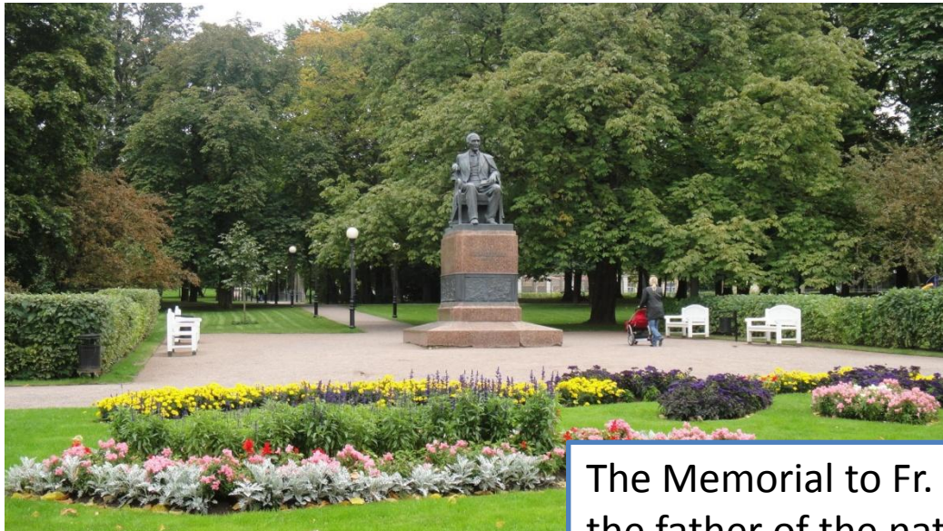
The Memorial to Fr. R. Kreutzwald, the father of the national literature for the country