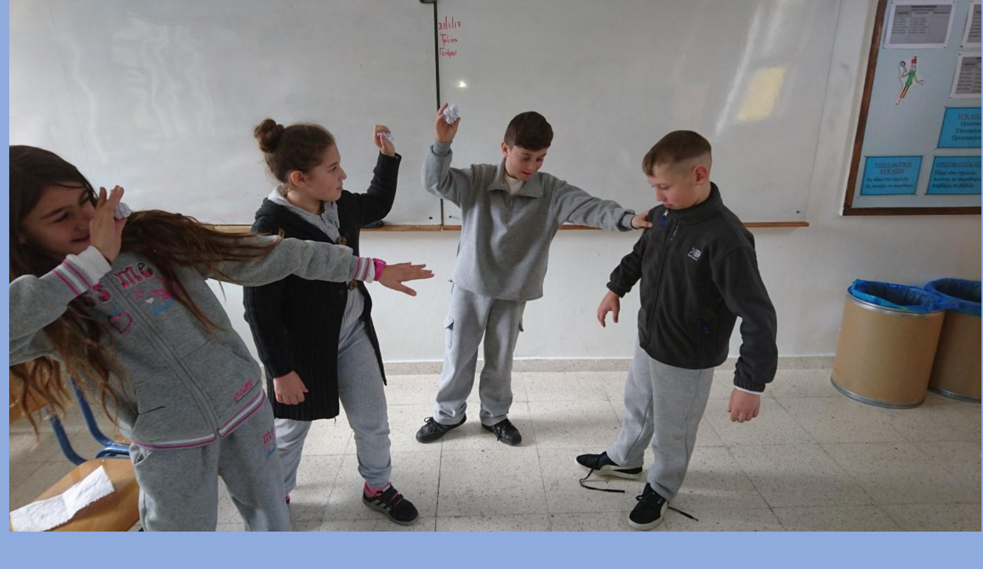
Who is the migrant student? Why did you choose this particular kid?