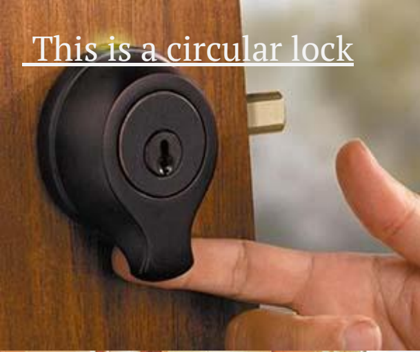
This is a circular lock