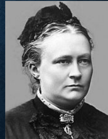
This is Minna Canth