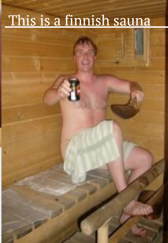
This is a finnish sauna