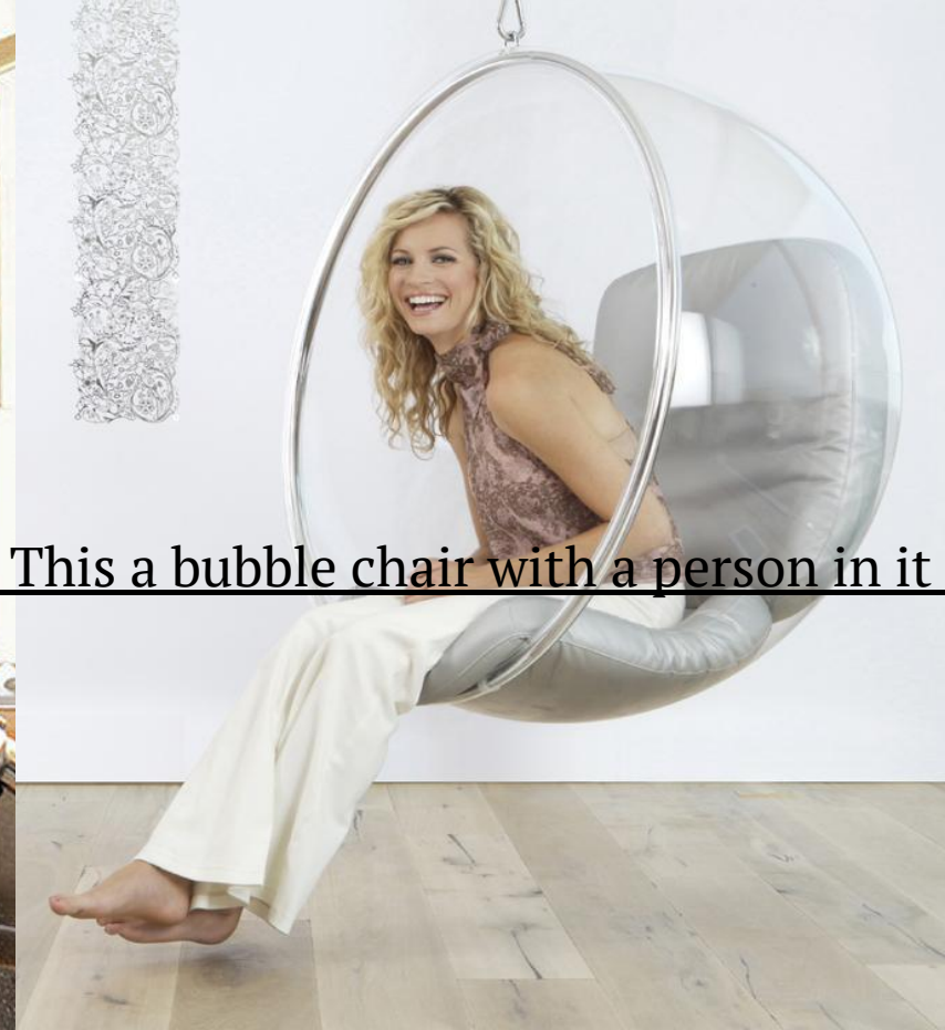
This a bubble chair with a person in it