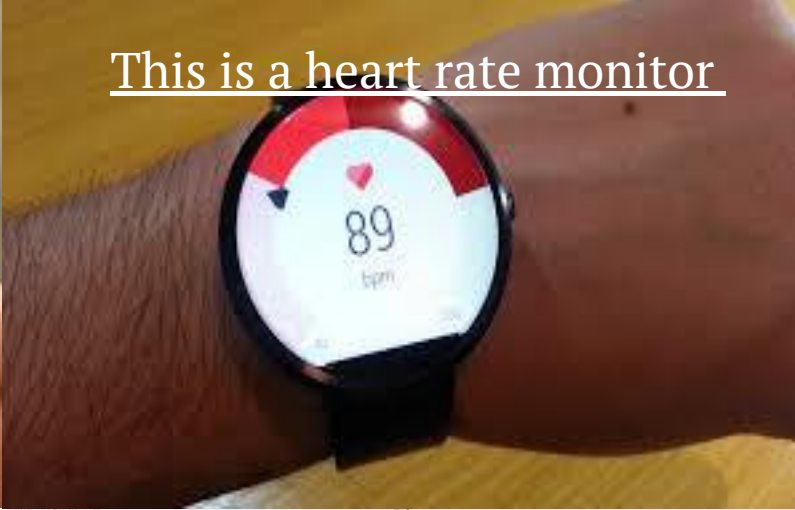
This is a heart rate monitor