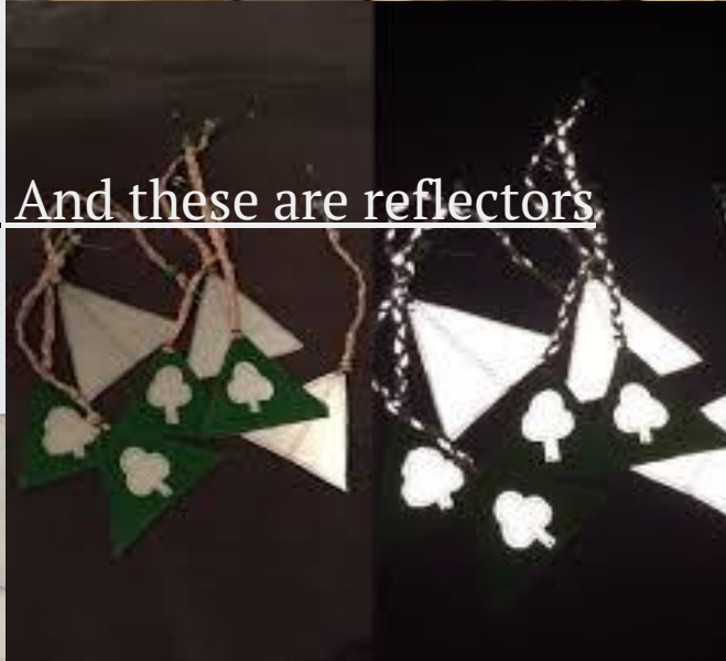
And these are reflectors