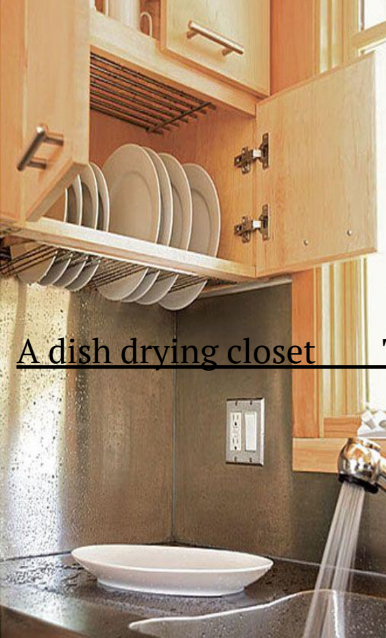
A dish drying closet