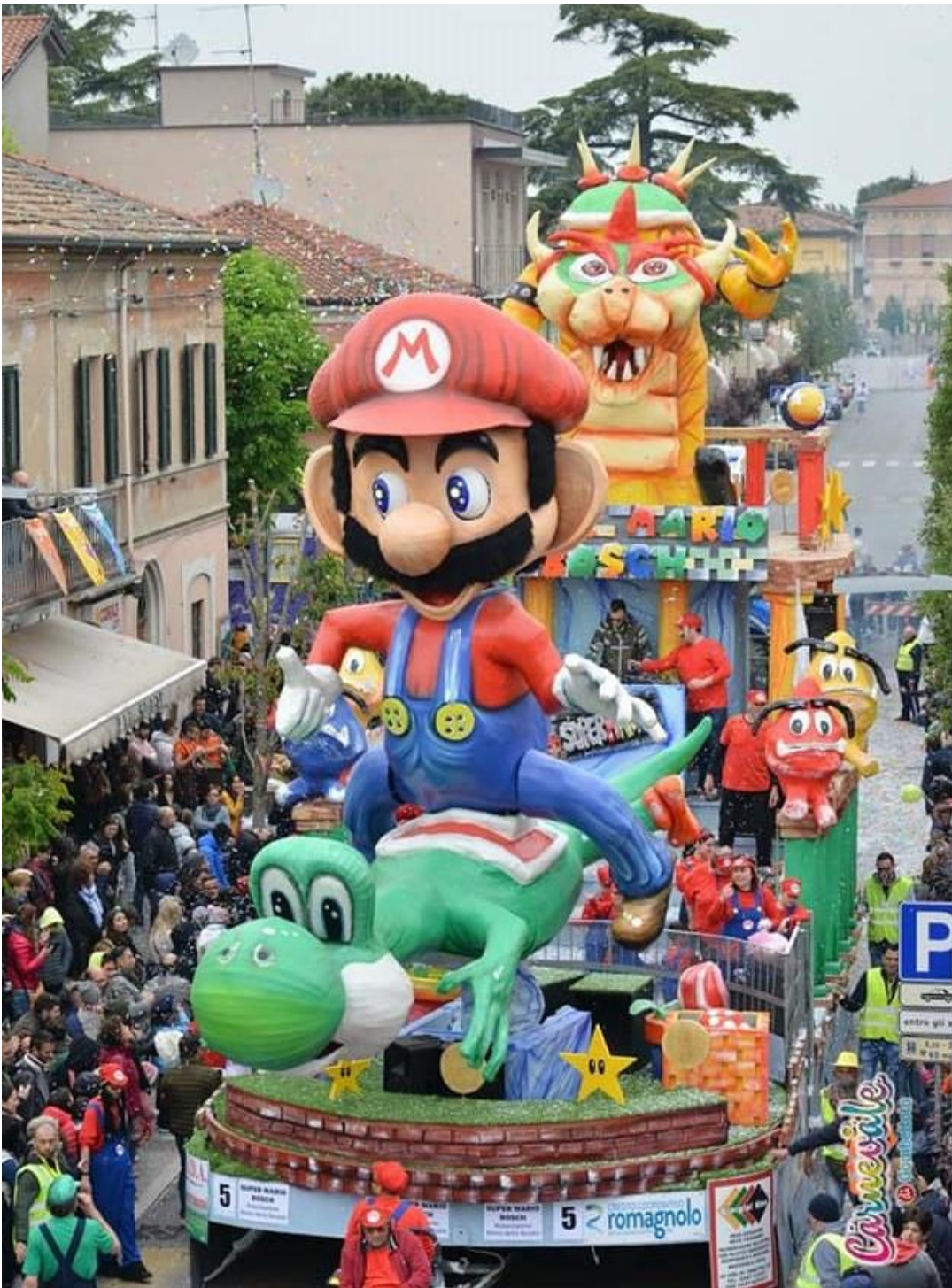
Super Mario Bosch, the charriot built by the School's friends Committee that won the first prize at the Spring Carnival parade, 22 nd April 2019.