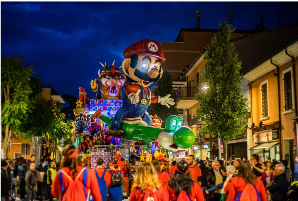
Carnival night parade held on the 18 th May 2019 in Gambettola.

The Carnival in Gambettola is supported by a powerful organizational machine, composed of many volunteers, which at the end of the fair allows this show to take place. Children dress in costumes and take part of this beautiful and funny parade. The school's friends committee build every year a big charriot and this year was: Super Mario Bosch. This charriot was awarded with the first prize.