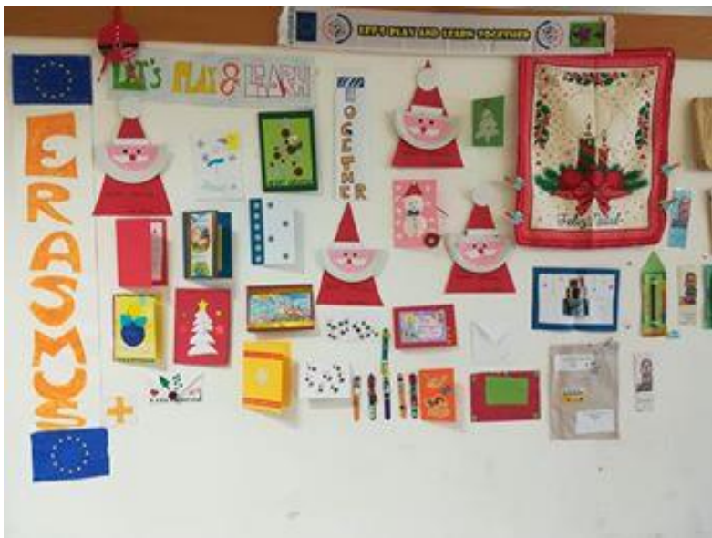
Erasmus+ corner with Christmas cards