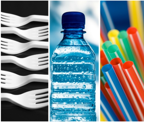
EXAMPLES OF SINGLE USE PLASTIC

100,000 tonnes of plastic from coastal land in the EU that ends up in the sea every year.