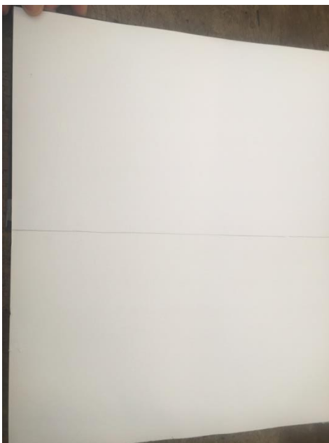
UNCOVERED SIDE (BELOW) in NEMOLI

The air we breathe in our town is quite clean because the cardboards changed in a hardly noticeable way their previous colour. The little difference between the two experiments is due to the fact that Lauria is bigger and busier than Nemoli.