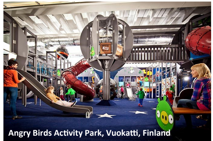
Angry Birds Activity Park, Vuokatti, Finland