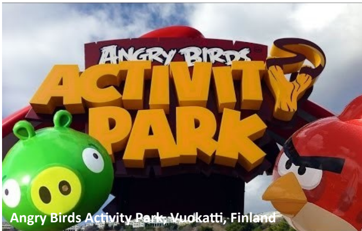
Angry Birds Activity Park, Vuokatti, Finland

folded, which turned out to be very entertaining. The rest of the workshop groups completed and put the finishing touches on their presentations. Lunch was delicious as it had been all week. We then left school at 3.45 pm and headed back to the hostel for dinner. That evening, we were meant to have a games and sports evening. However, the snow meant that we had a games night at the Barn at Hyvärilä. We played games, such as zombies and twister and we also learn some new Finnish and Austrian games that were really fun. Once everyone had left, we went back to the hostel and dragged all of the spare mattresses out to form a couch again and played cards until quite late, ensuring that the next morning we looked like zombies!