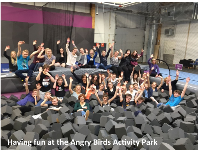
Having fun at the Angry Birds Activity Park

“Tuesday was the second day of our trip and so everybody was still struggling to open up to each other. To conquer this, we decided to increase the time of the morning energiser to try and break the ice. The activities we did were: standing in a large circle, introducing ourselves and saying one interesting fact about ourselves. The second activity was where we were tied with rope to a student from another school and we had to figure out how to untie ourselves. These activities were really good for making things less awkward between all the students. After this, we spent most of the school day in our workshop groups. The work we produced can be seen on the Erasmus website. On Tuesday evening, we had a games night at the barn next to our hostel. We played games such as Chinese Whispers and Splat. Overall, it was great fun and helped to improve the interaction between the students.”