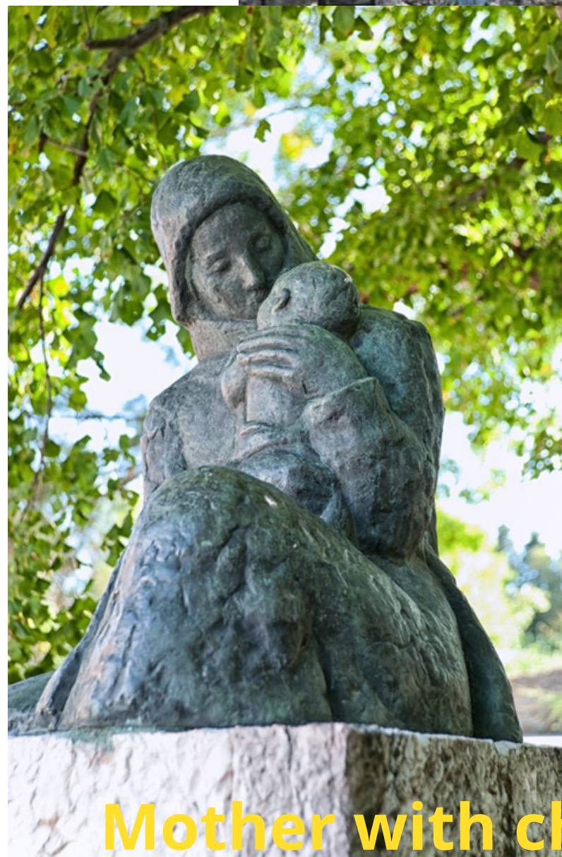
Mother with child