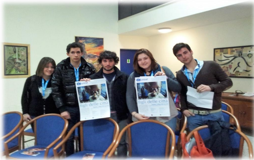
14th March 2012 UNICEF - Children's Rights «Sons of Cities» - International Report– Catanzaro Classes III section B – Class V section C