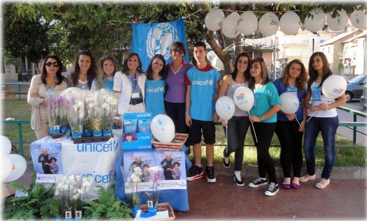
October 2012 The students from Institute Malafarina and Scientific High school publicize the goals of UNICEF and children's rights to the local community