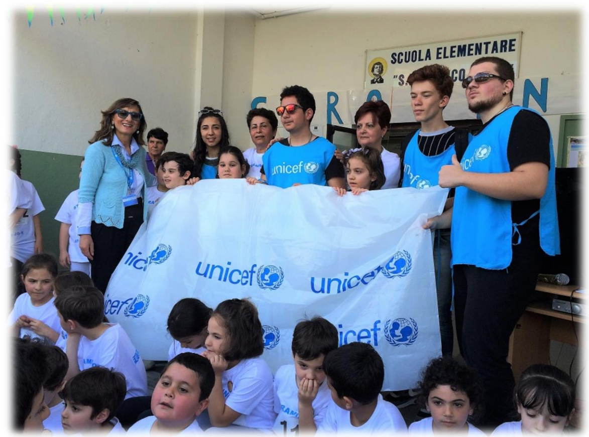
8th May 2015 Sensitization of Elementary School students «helping children in the Straminot» – Soverato Class IV section C