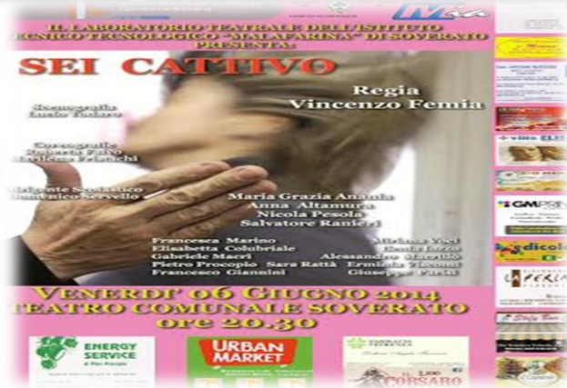
Musical against women's abuse Theatre lab - teachers: Femia-Fristachi- Todaro Students involved: all classes