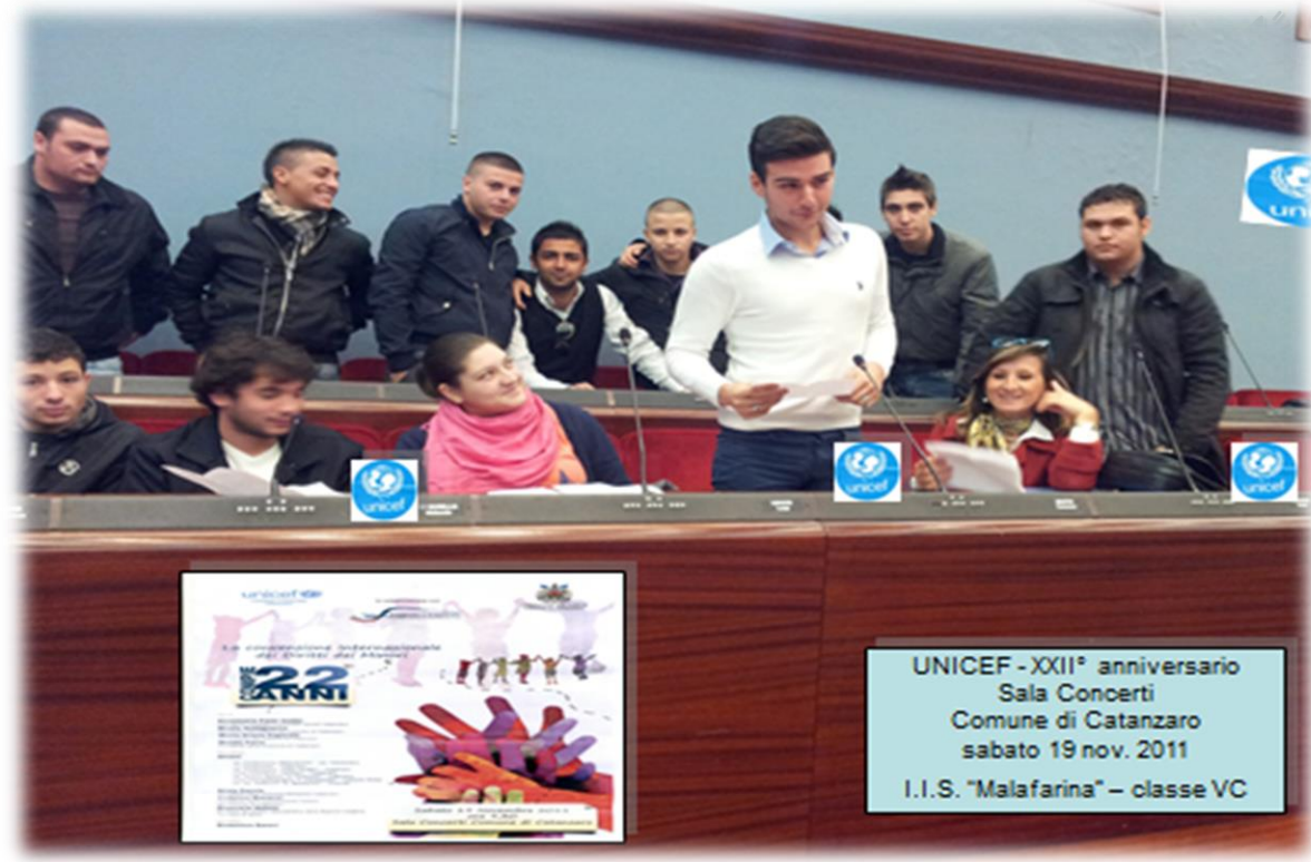
Saturday 19th November 2011 UNICEF –XXII Anniversary – Convention on the Rights of the Children – Municipality of Catanzaro -Class V section C