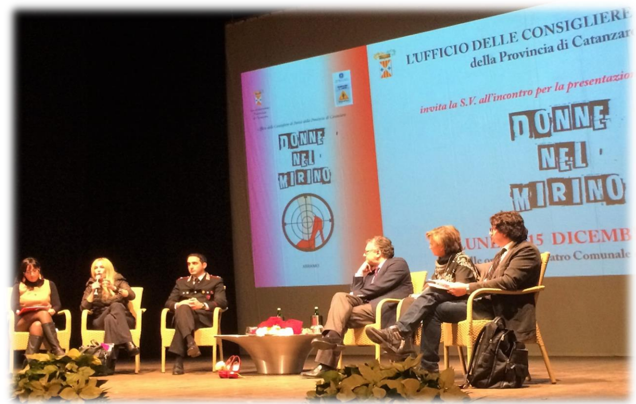
15-dec. 2014- Sensitization against Violence on women - WOMEN IN THE TARGET - Soverato Theater