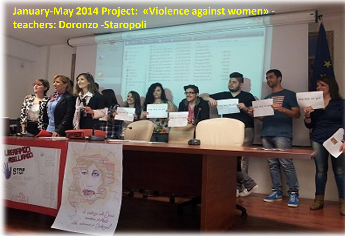
January-May 2014 Project: «Violence against women» - teachers: Doronzo -Staropoli