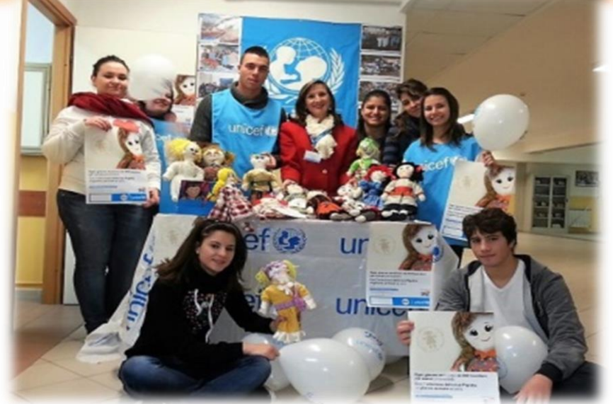
December 2012 UNICEF PIGOTTA Classes IV sec: A-B-C