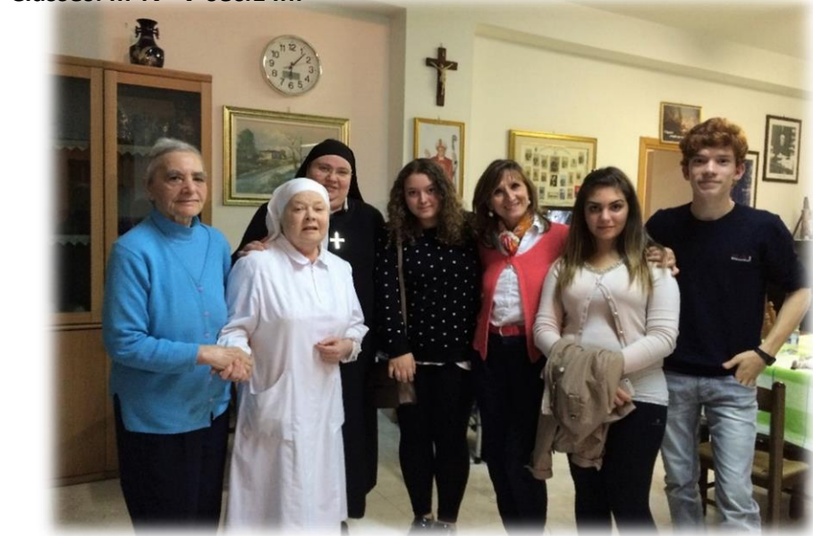
December 2015 Retirement Home "Saint Gerardo Maiella" Class V sect. C cat