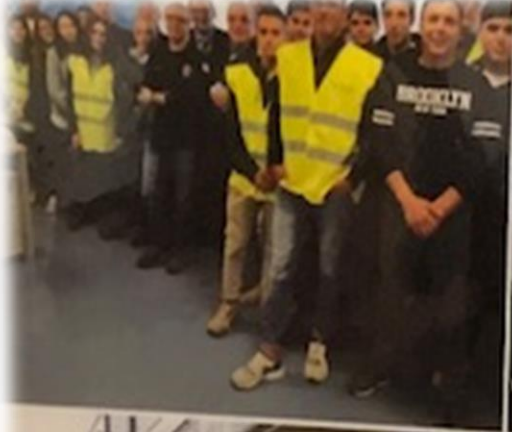
2016-17 ALL TOGETHER FOR THE SAFEGUARDING OF OUR NATIONAL TERRITORY -.