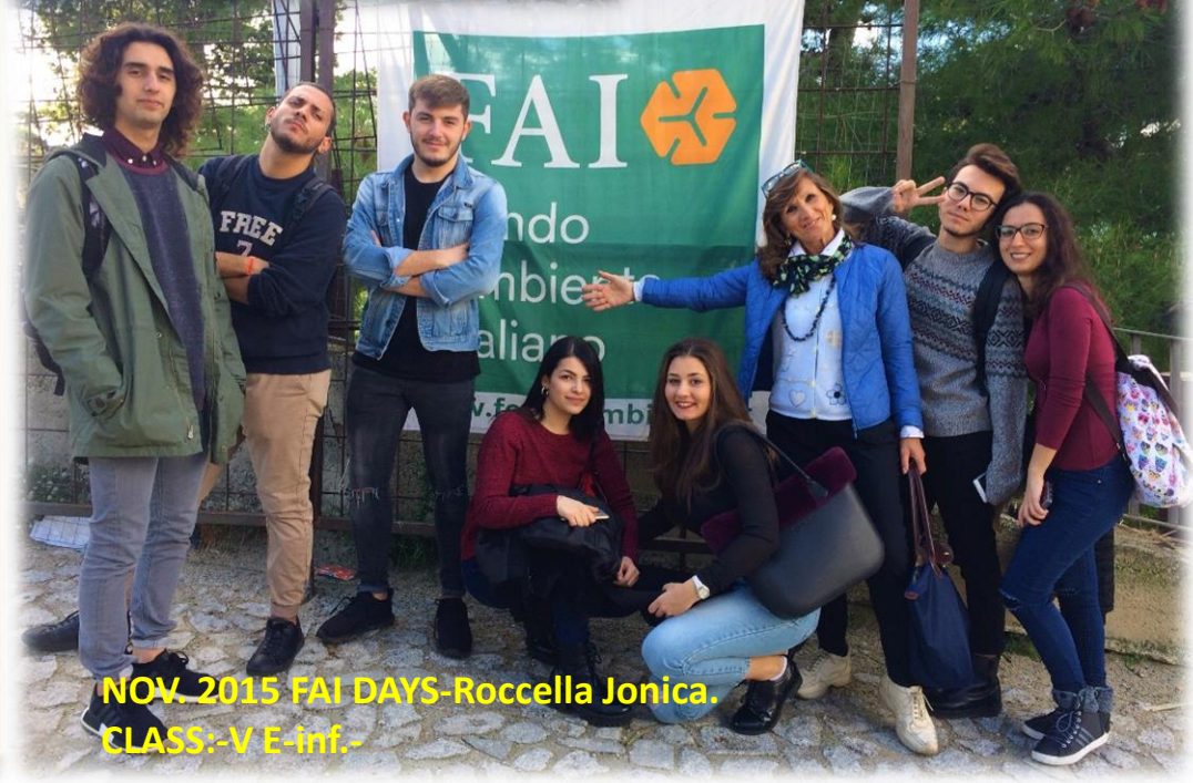
NOV. 2015 FAI DAYS-Roccella Jonica. CLASS:-V E-inf.-