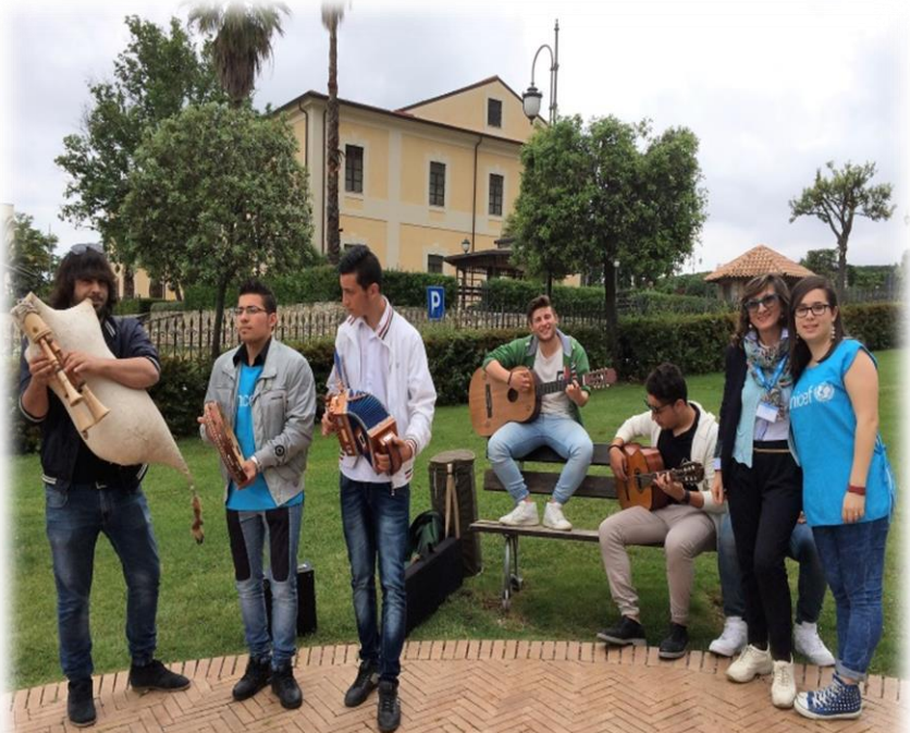
28th May 2015 UNICEF- GUI 2015 "The Defense of the Environment" - Biodiversity Park - Catanzaro classes IV - V sect. A-B -C