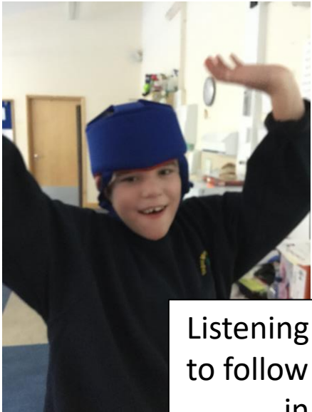
Listening and looking to follow instructions in yoga