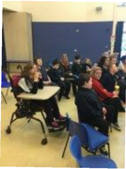
Listening, enjoying and taking part in Assemblies and listening to visitors