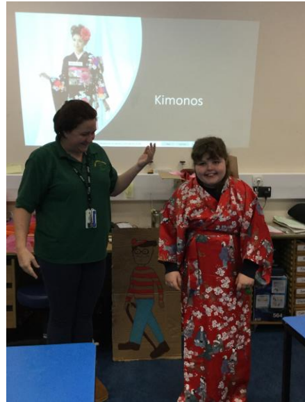
Listening and taking part in group activities in class