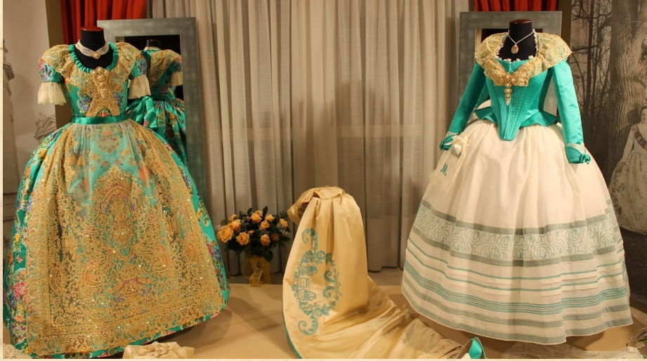
Fallera's shoes and custom