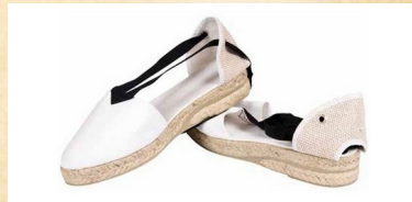
Llauradora's shoes and custom