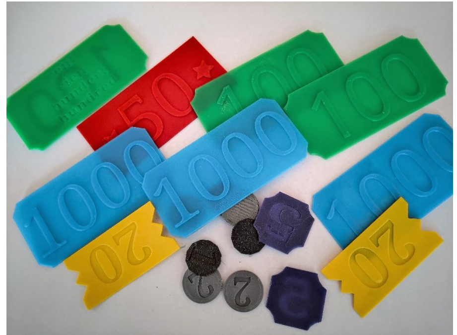
Plastic money 😊