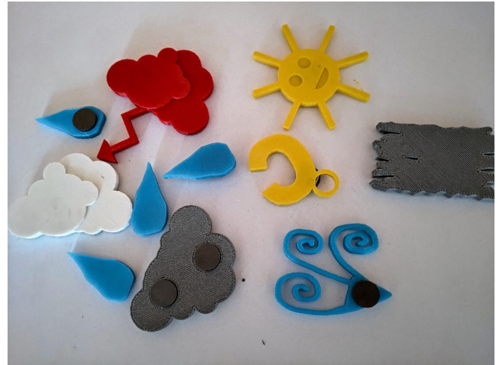
Talking about weather