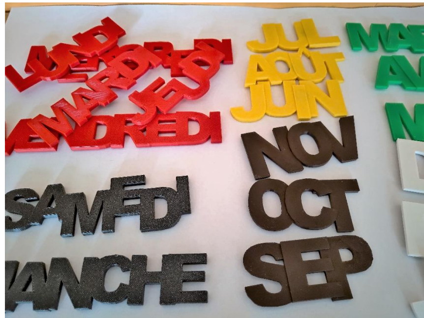
Our own calendar