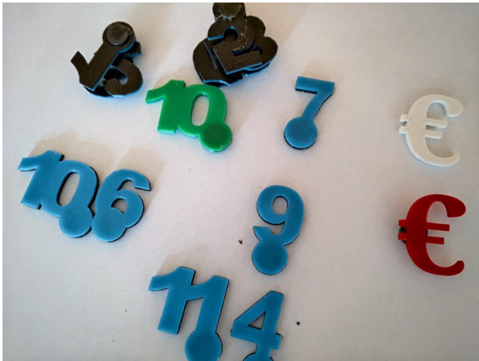
Numbers and prices...

To explore some possibilities of “mixture of virtual and real”, we tried to use 3D Printing to create specific educational material for our classes. Benefits? Teachers are able, with a little of knowledge and skills, “print” educational tools and games for their specific educational goal. Perfect. We used PRUSA Printers and Tinkercad.com to create these examples (mostly for language classes):