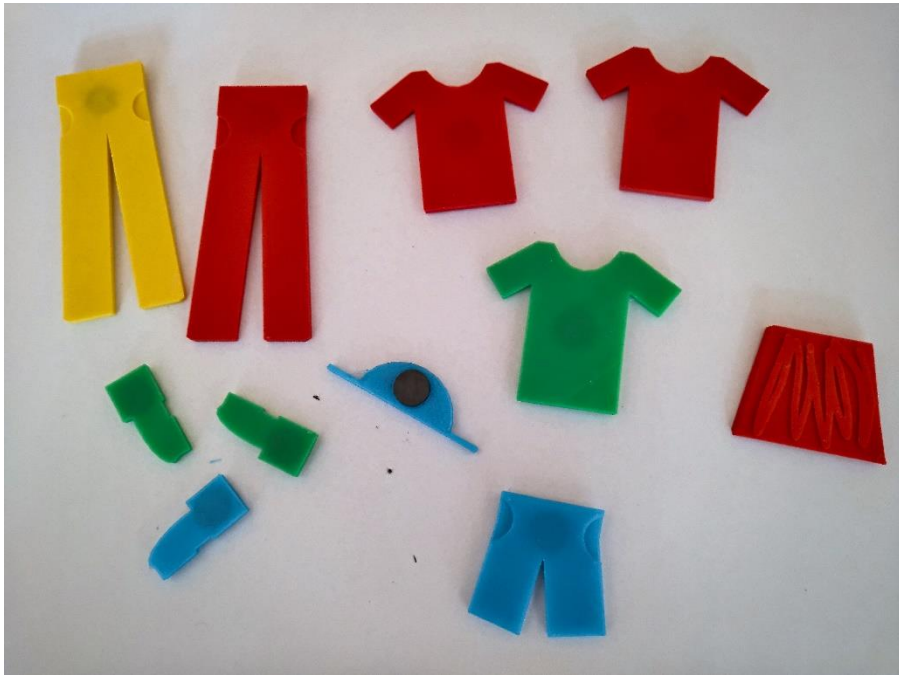
Cloaths – description of fashion styles