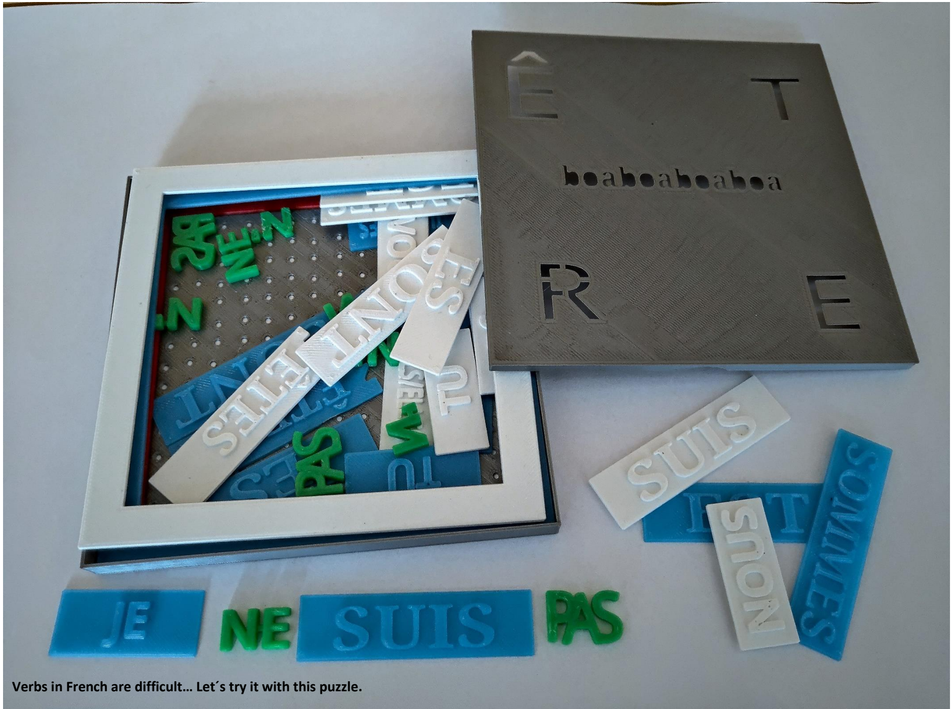
Verbs in French are difficult... Let's try it with this puzzle.