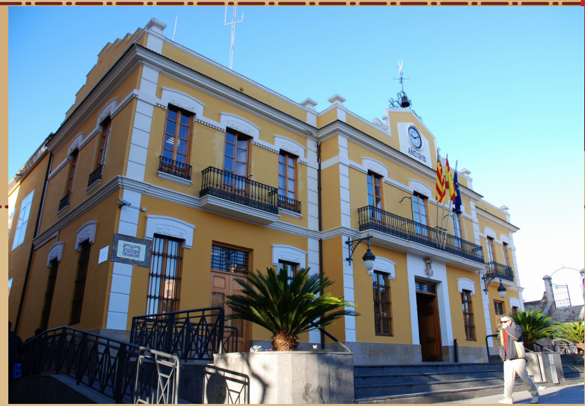
Hall of Brujassot