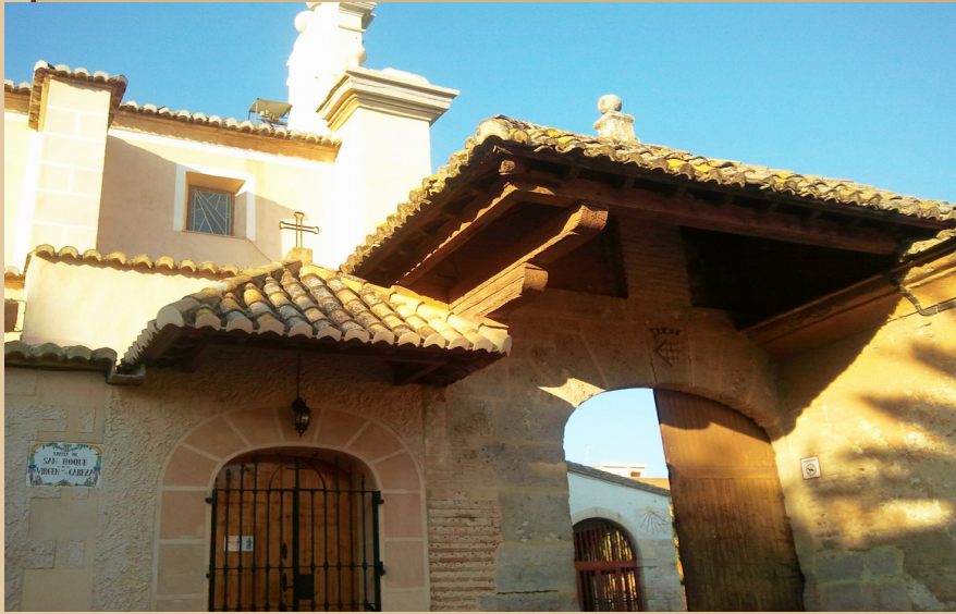
Los silos (church)