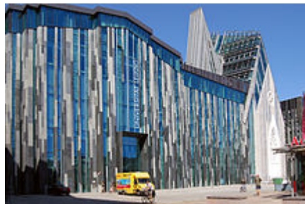
New University Building