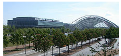
New Leipzig Fair Area