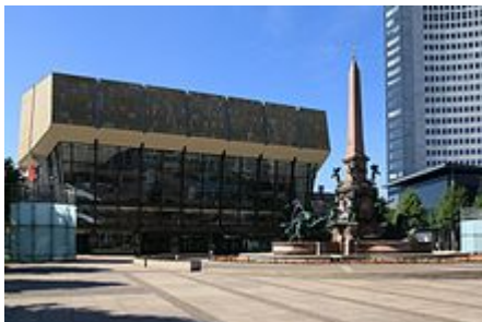
New Concert Hall Gewandhaus