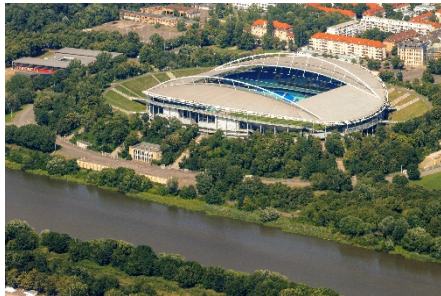
Red Bull Arena