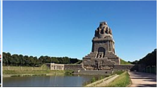
Battle of Nations Monument