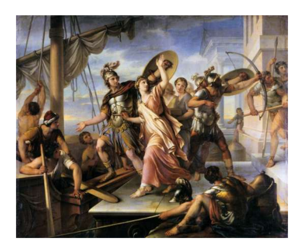
Helens' Abduction Hamilton, Gavin, 1770