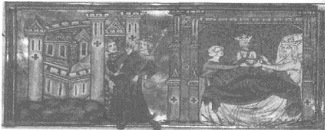
2 Η γέννηση του Αλεξάνδρου. Από το Ιωάννης ο Καλός, Miroir des histoires , περ. 1345. Λέιντεν: χρφ Voss 44F.3a. f. 157v.