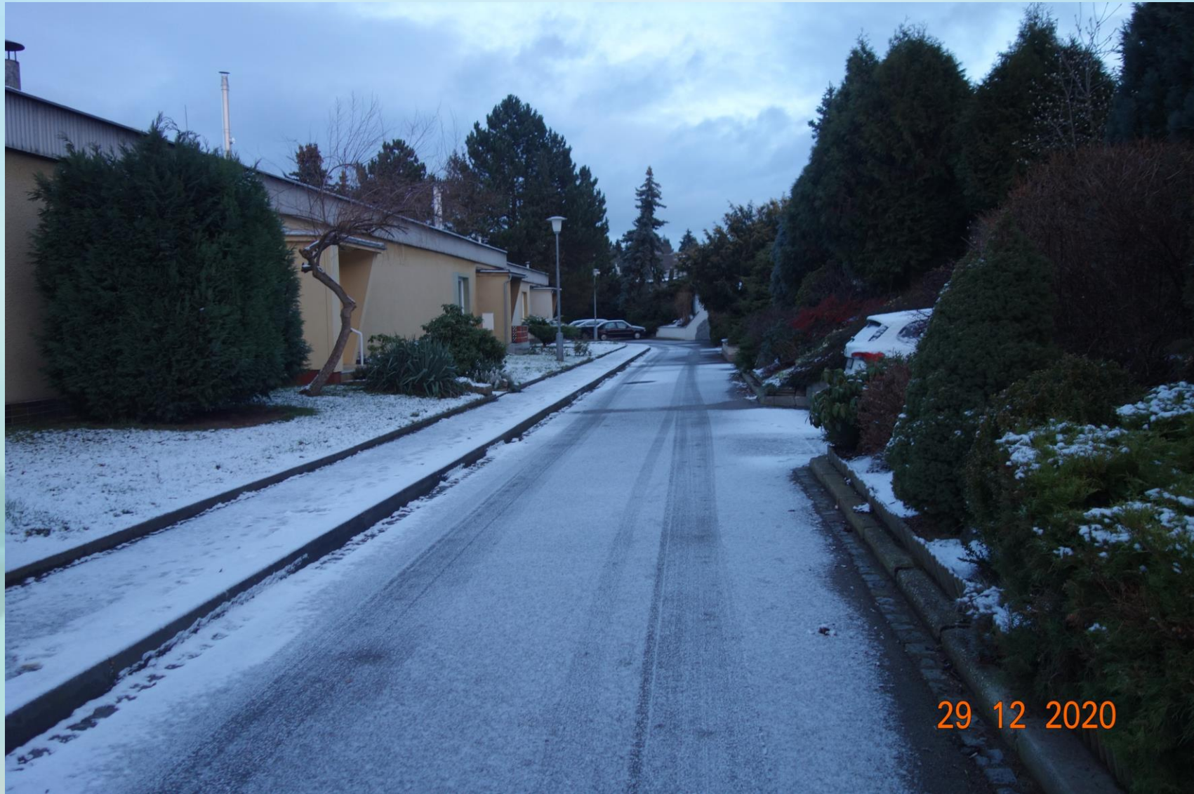
first snow in our street