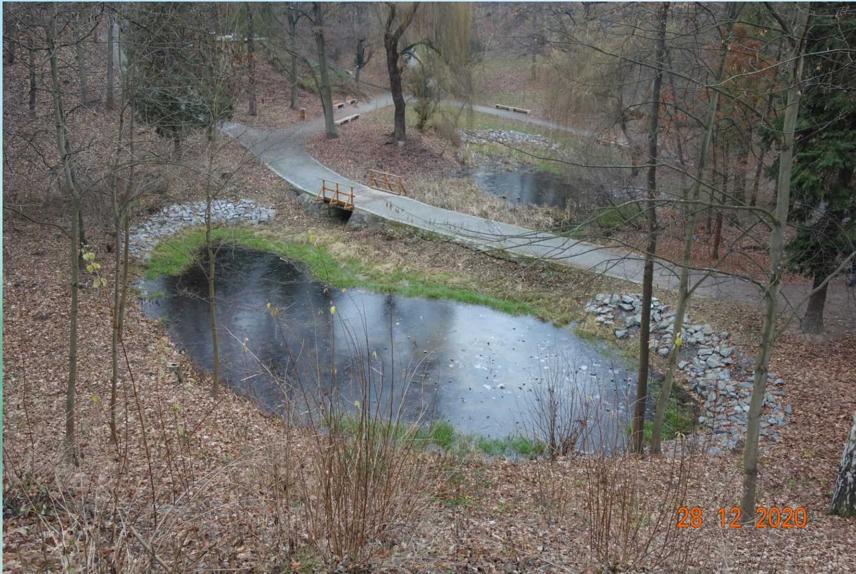
frozen lake in the park in Pilsen