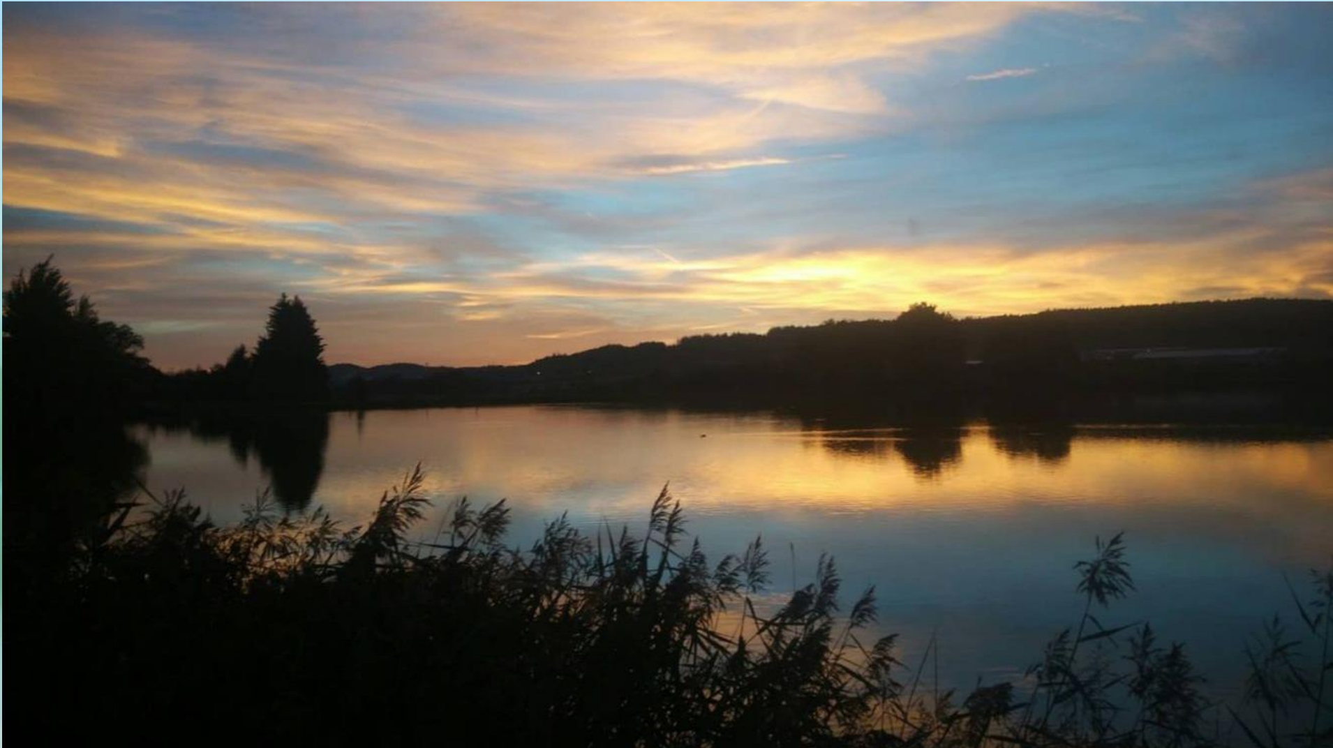
the wordless view of sunset above the pond