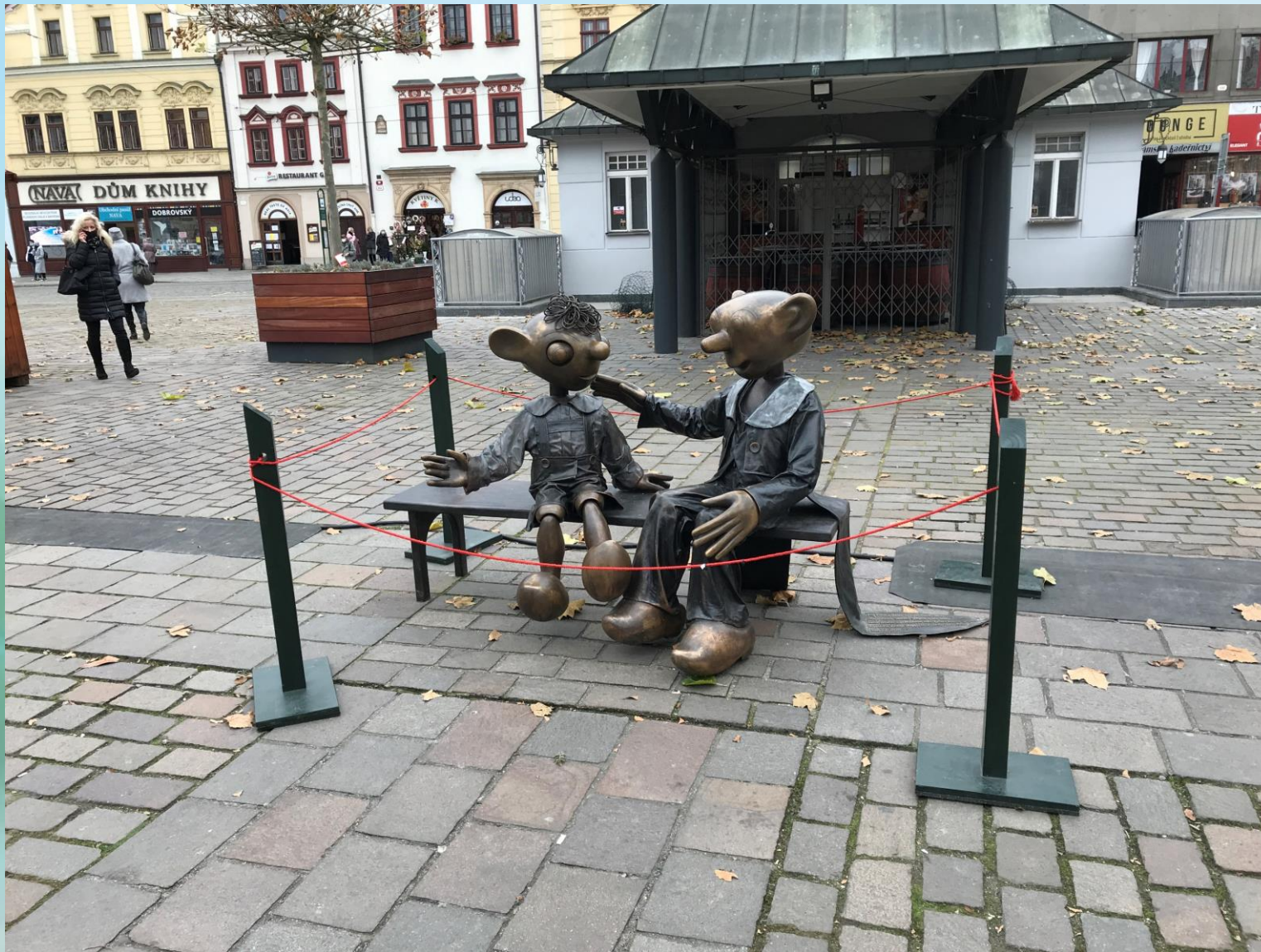
Spejbl and Hurvinek Pilsner puppets