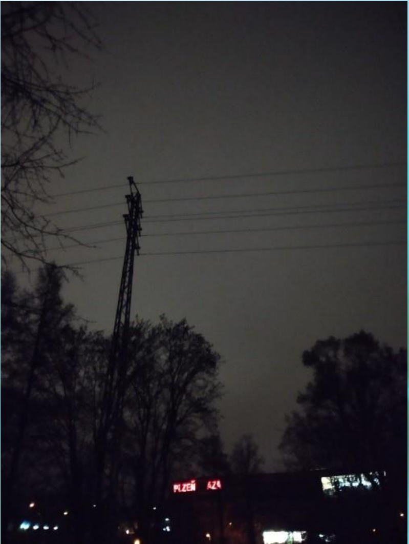
the blowing wind through leafless trees in Pilsen