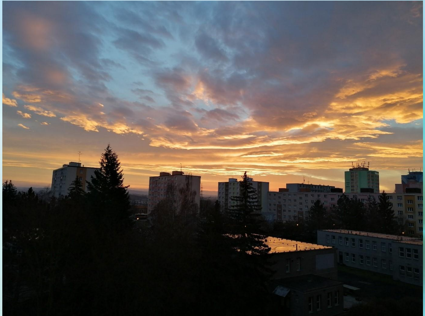
6 a.m. in Pilsen