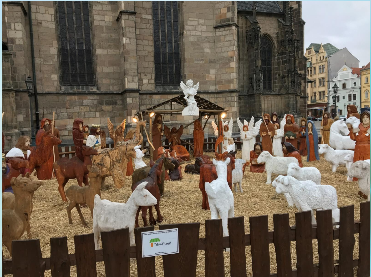
wooden Bethlehem in the Pilsner square