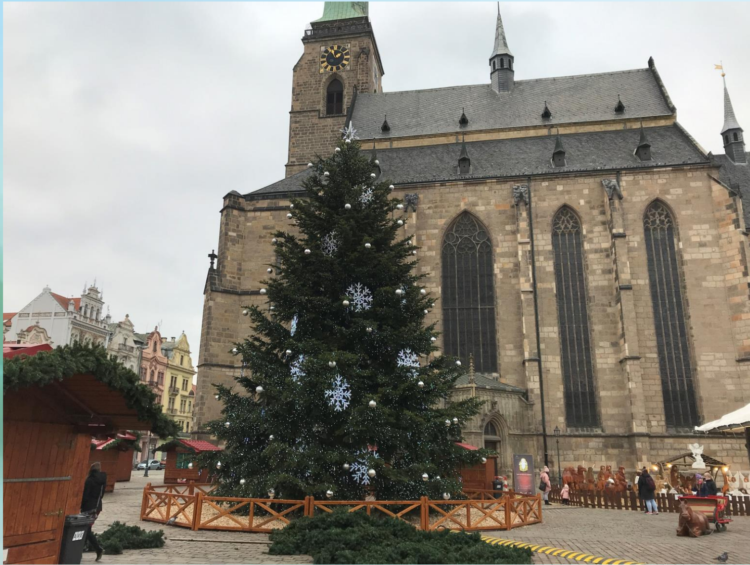
Pilsner cathedral with Christmas tree