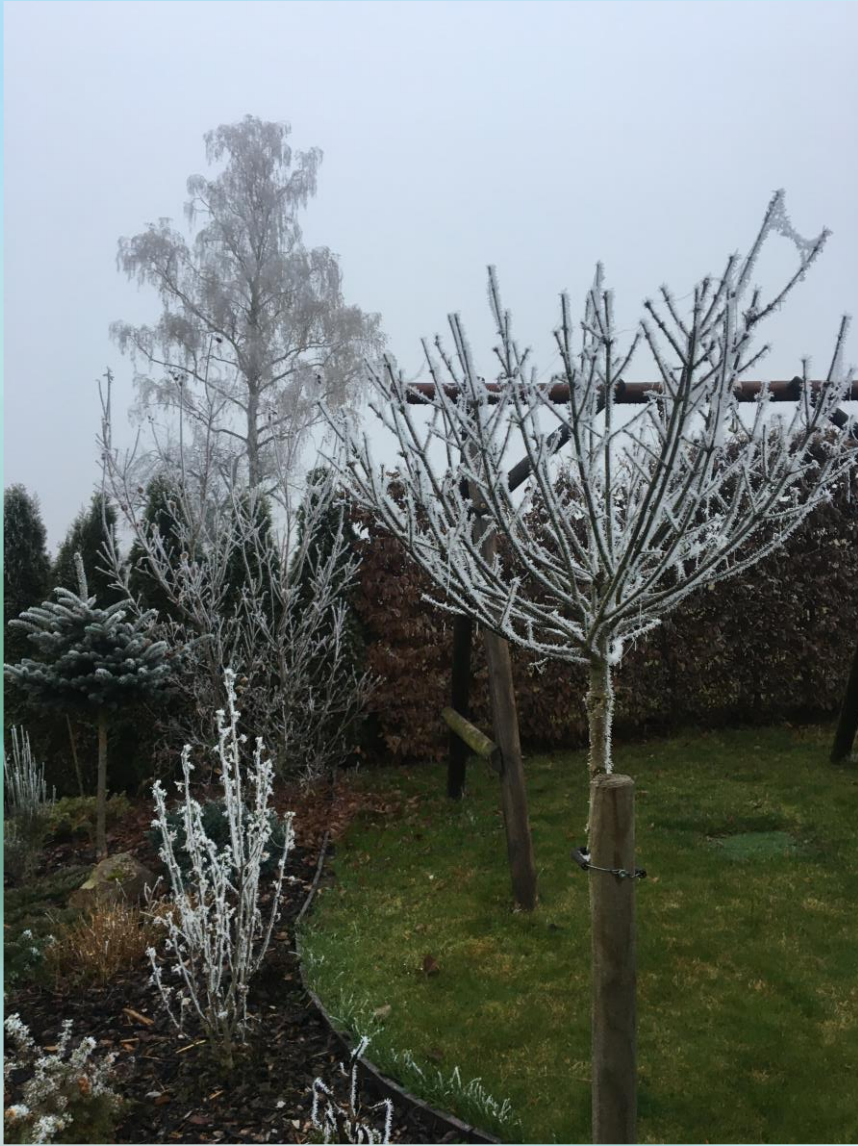
the frozen leaf of birch