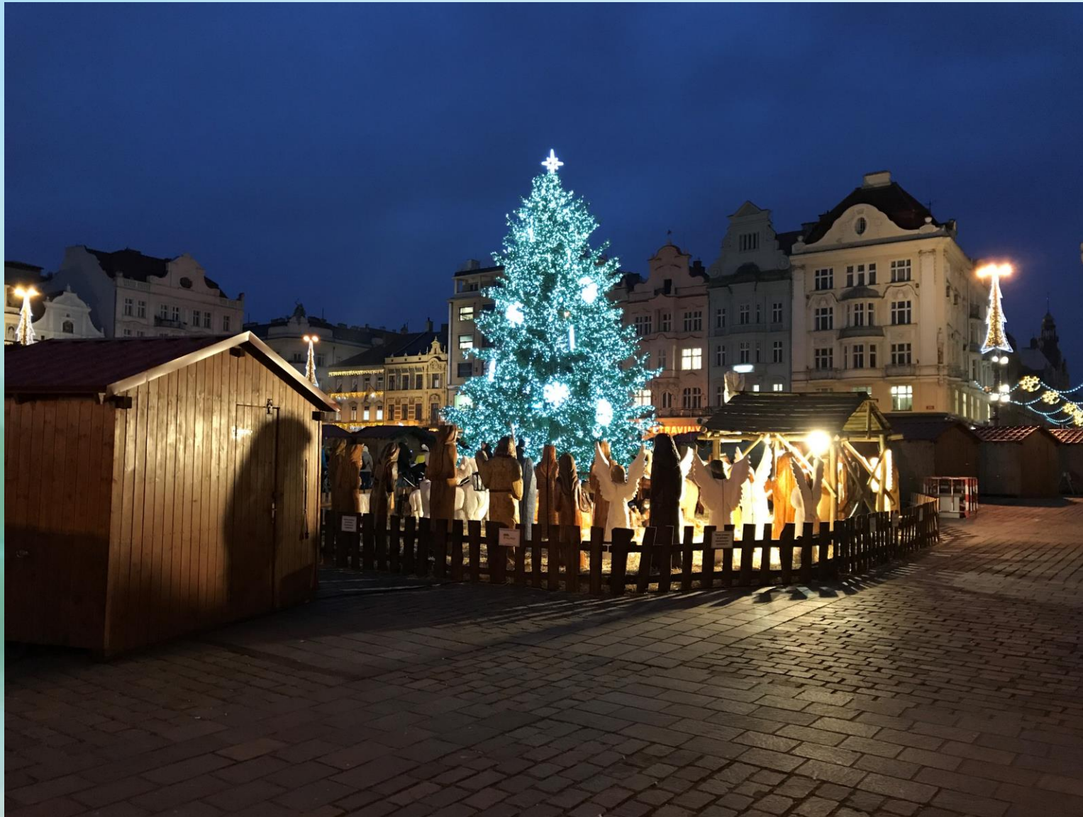
Christmas tree in the Pilsner square