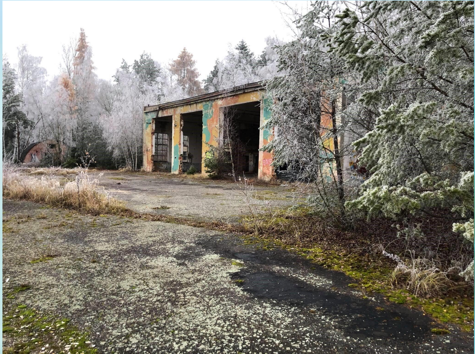
abandoned military place with frozen trees