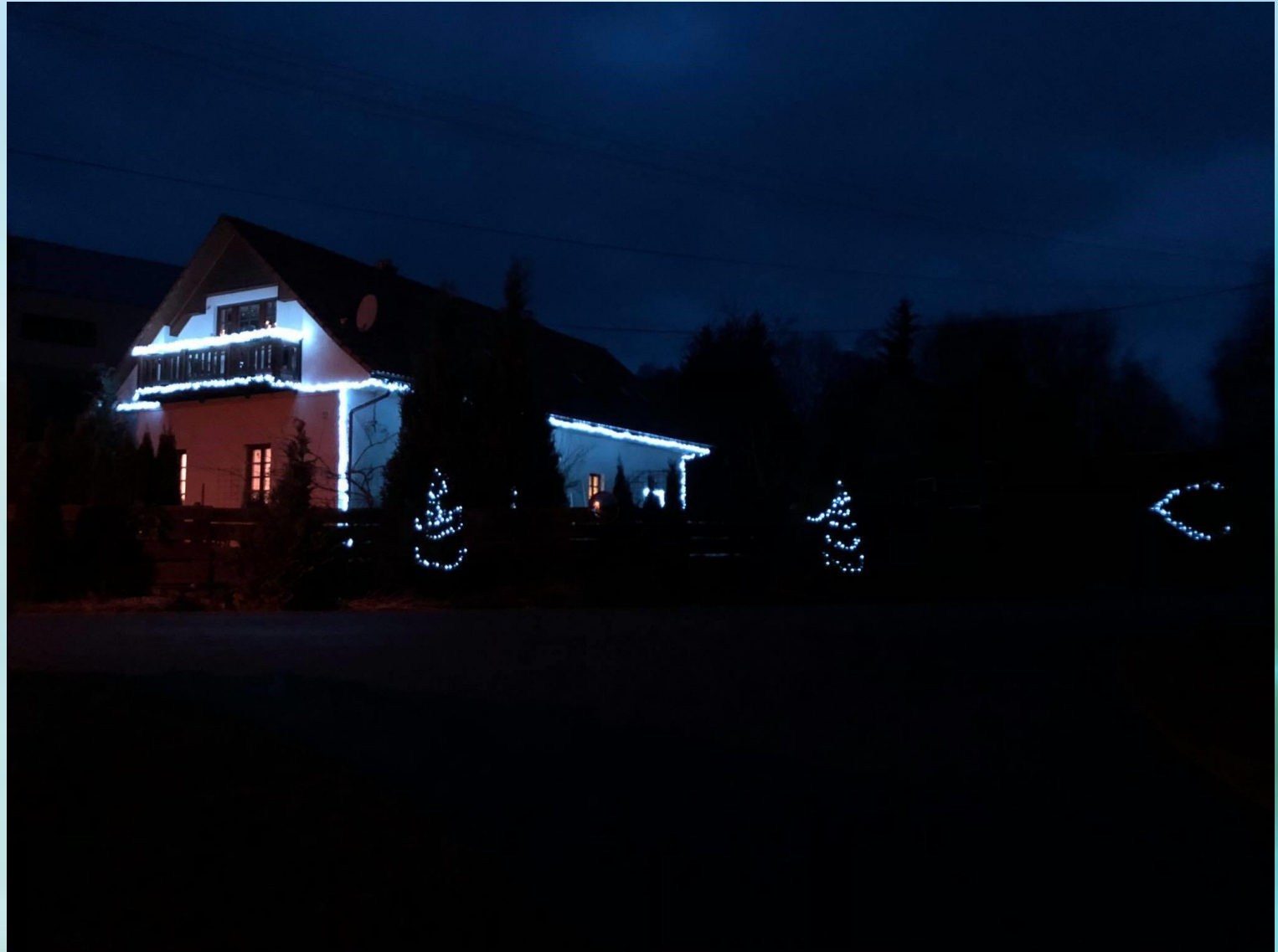
decorated house in the village