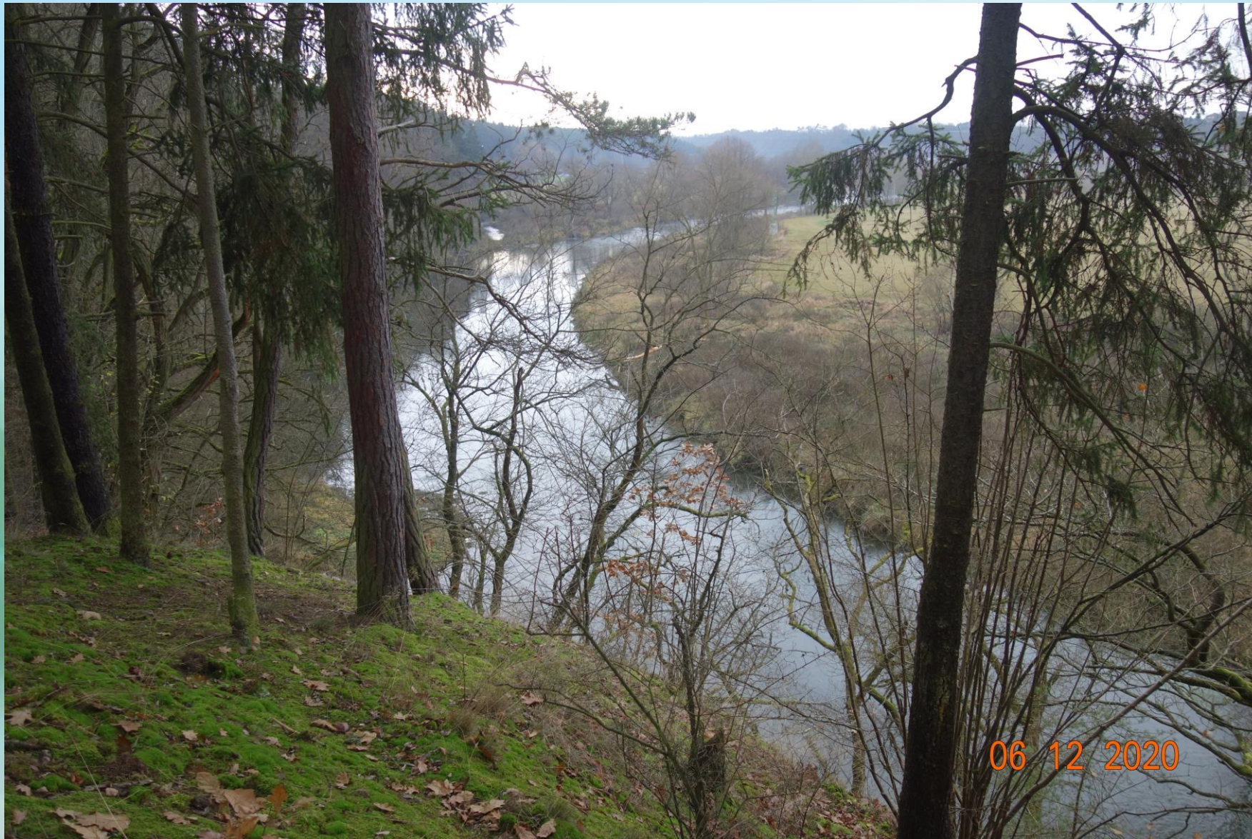
the River Radbuza near Pilsen