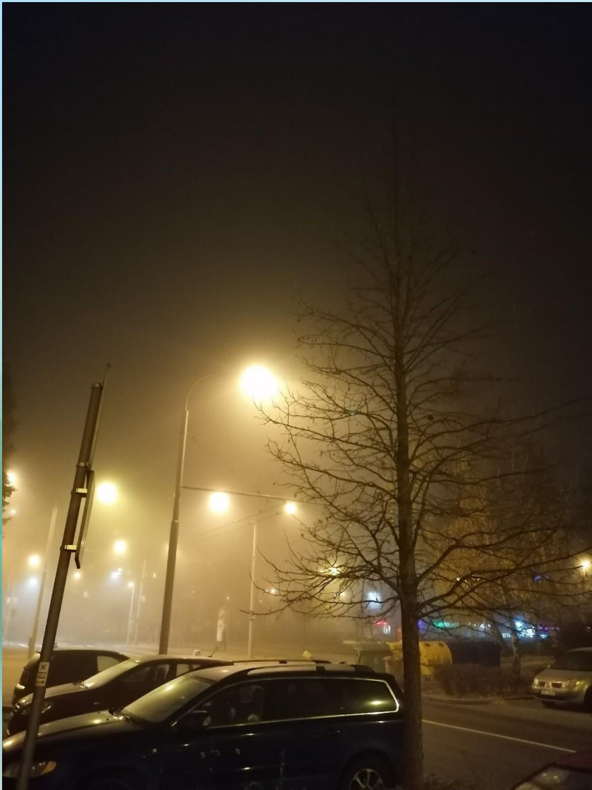
fog in the city