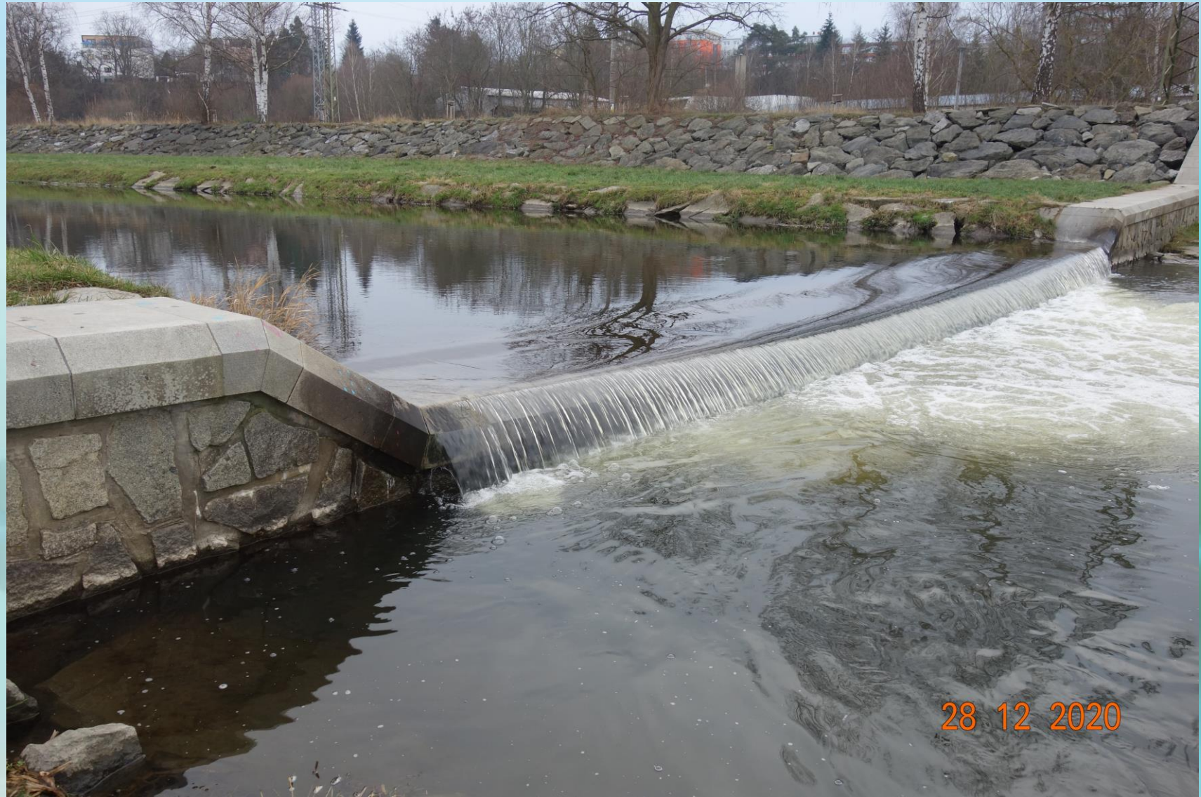
the River Úslava in Pilsen