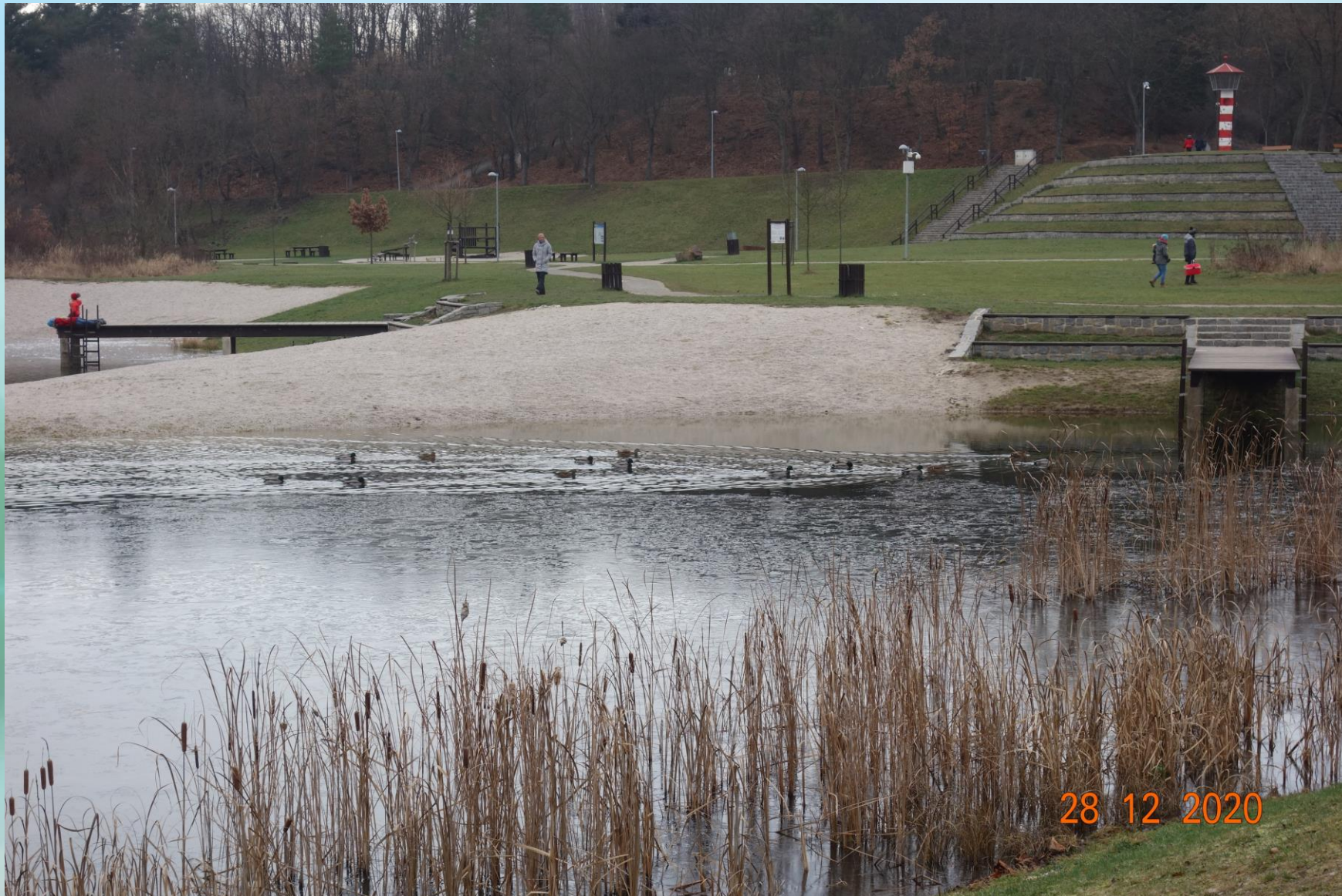
park in Pilsen