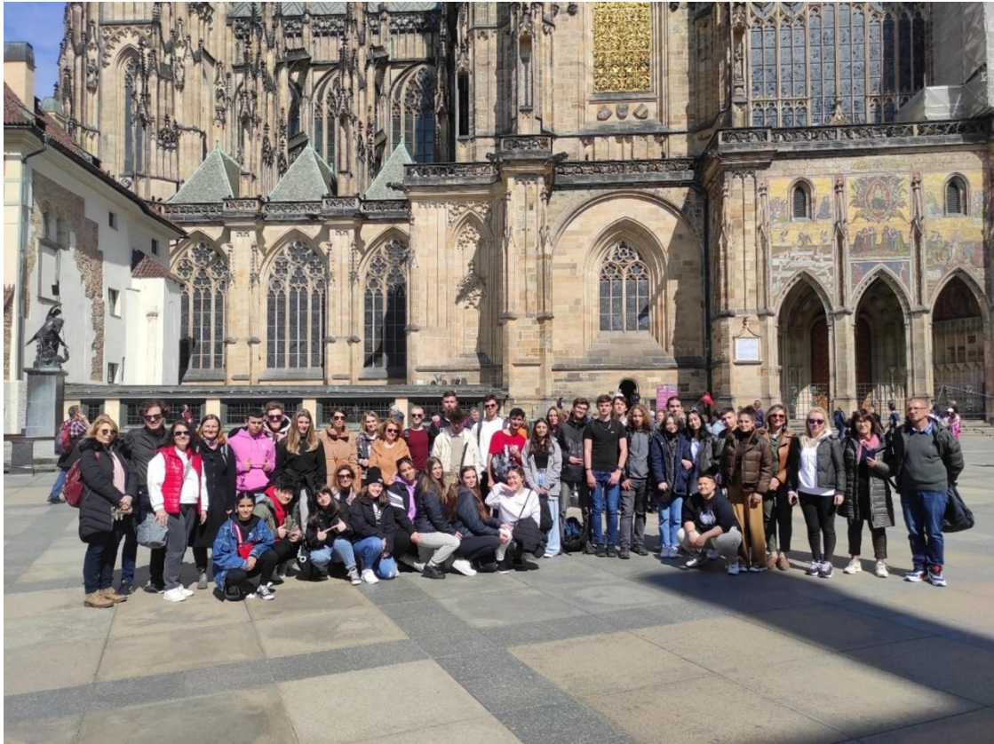
Erasmus students and teachers in front of St Vitus cathedral at the Prague Castle.

During the day, all international teams made photos and collected materials for their final presentations.