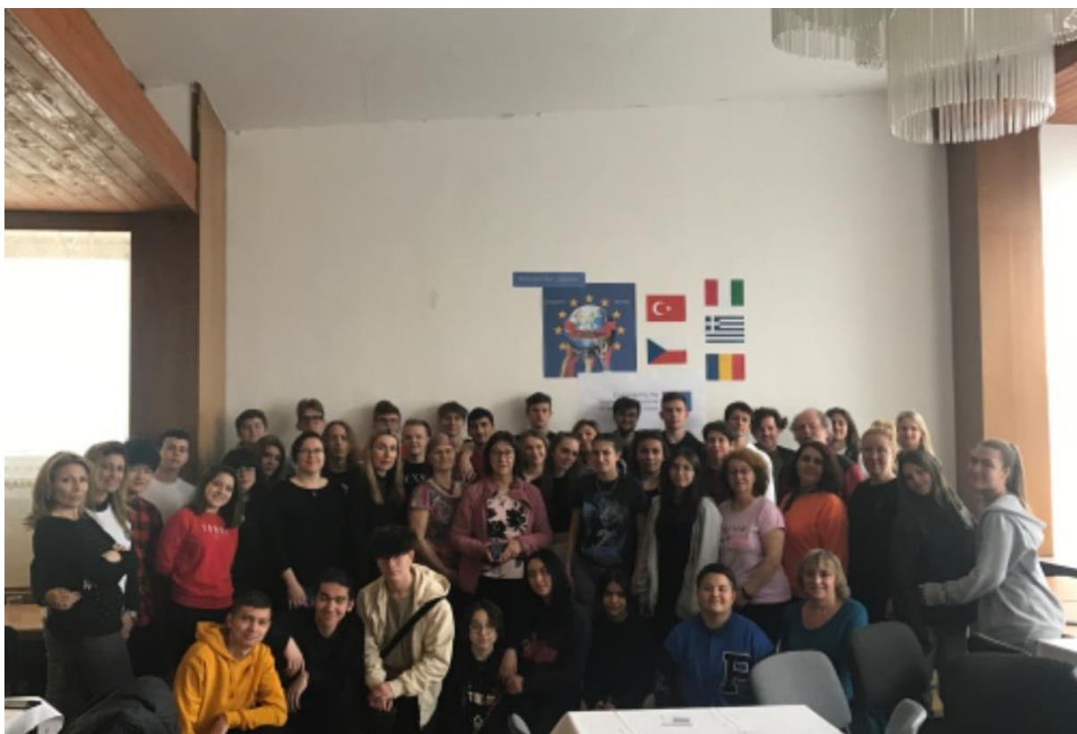
Erasmus students and teachers from all participating schools

The final point was a group photo and a farewell of all participants.