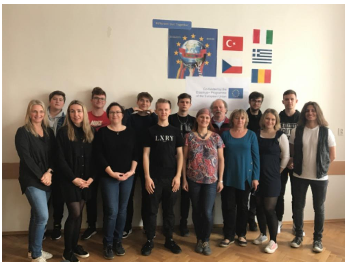
Erasmus students and teachers from the CR