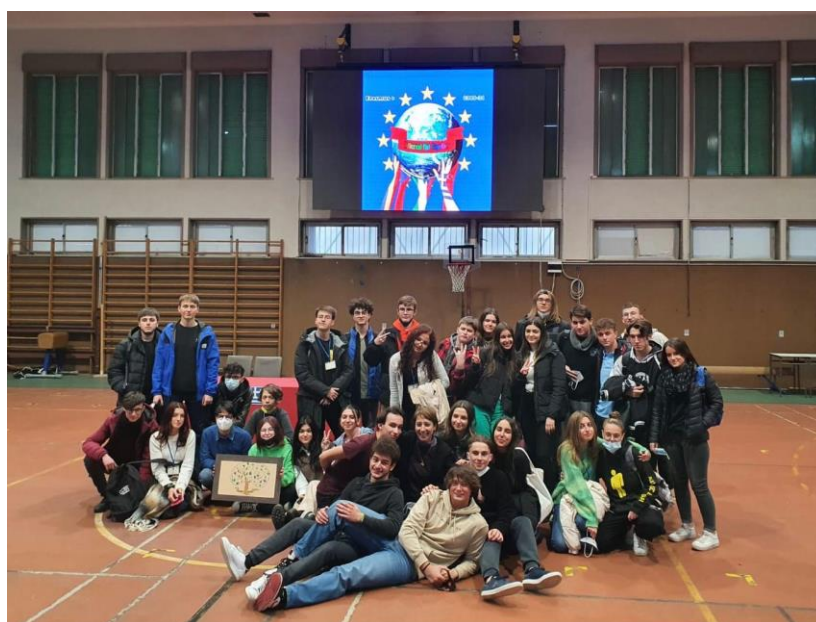
Figure 18. The entire team of the mobility

This activity taught us a lot of things about other people, other nationalities and showed us that it does not matter how different we are, but the fact that we were there together. And together