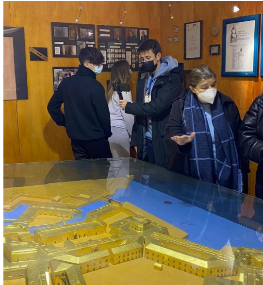
Figure 5. School tour

On this day (10 th of December) the students and teachers from Italian group presented us their school and a museum inside of it. We really enjoyed that tour because of the interesting special labs, large gyms and a lot of welcoming people.