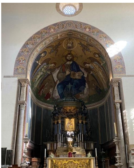
Figure 3. Inside the Duomo

After we came and took a lunch break, we went again in an study trip to the Panoramic Road and Sacratio di Cristo Re, Santissima Annunziata dei Catalani and more other beautiful historical sights.