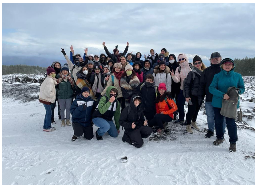
Figure 8. Joy on the snowy volcano