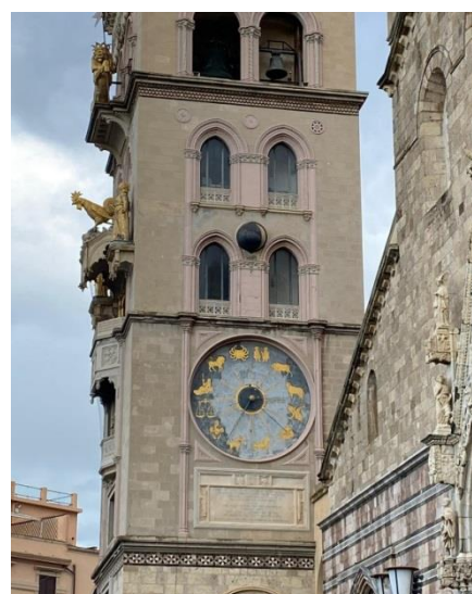
Figure 4. The Bell Tower