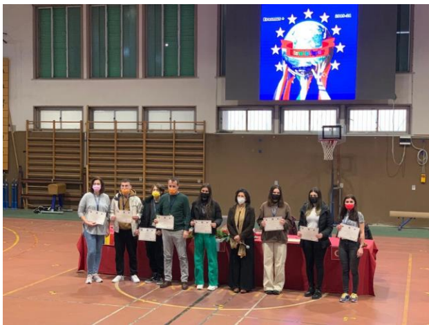
Figure 16. My Romanian team

In the last day (13 th of December) of the mobility we attended the awarding ceremony where each student and teacher received a certificate for the involvement in this program. Later, we presented our theatre and artistic scene about being different but together at the same time. And we also saw a presentation of a robot made by the students from IIS Verona- Trento.