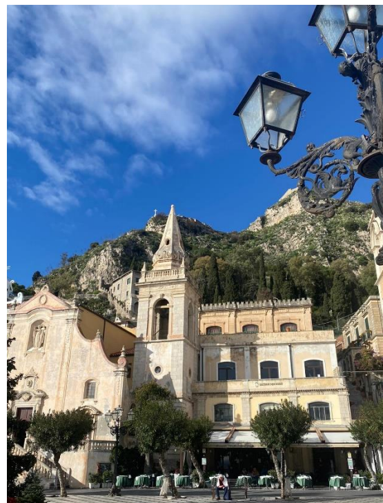
Figure 12. In Taormina