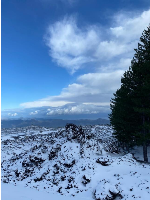
Figure 9. Etna Volcano