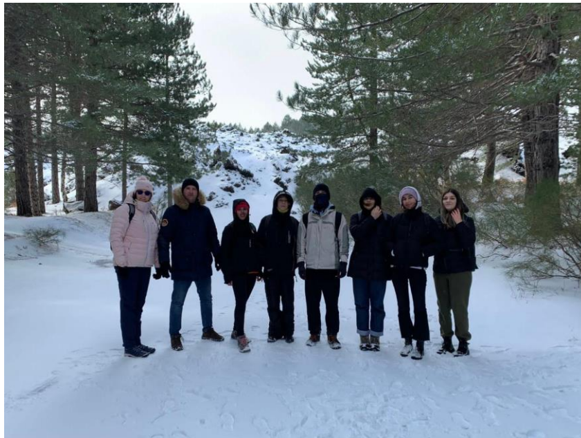
Figure 7. During the volcano study trip

The third day (11 th of December) was the most waited one. In a large group of teachers, students and professional guides, we went on a hike around the Etna Volcano. The guide told and showed us a lot of interesting information, such as lilies growing on hardened lava, which proves that lava is good for agriculture.