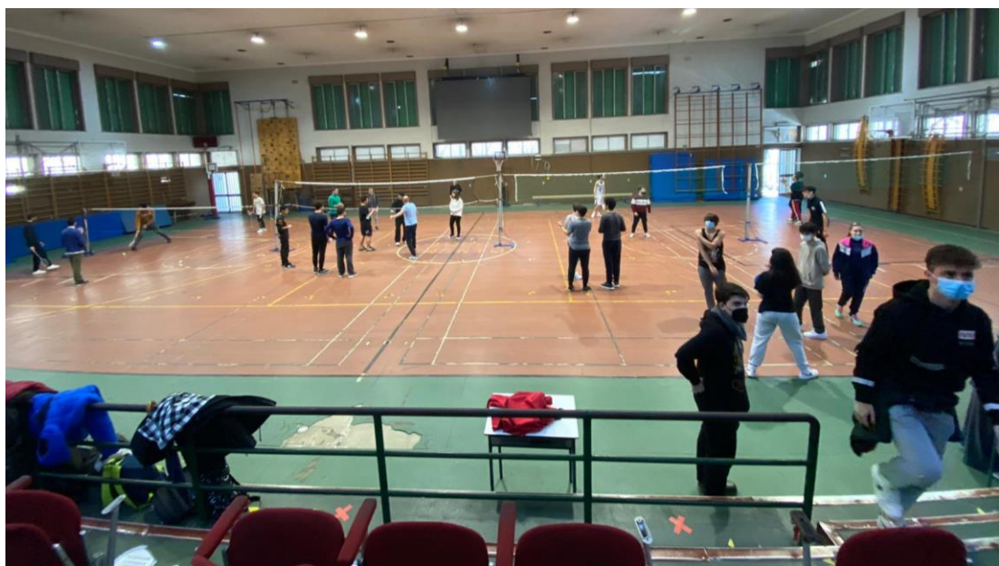
Figure 6. Theatre workshop

Also on this day, we were divided into 5 groups with students from each country to prepare a theater stage inspired by our project name: “Different but together”.