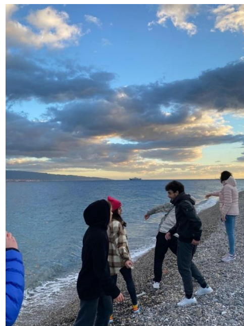
Figure 15. Building friendships and memories