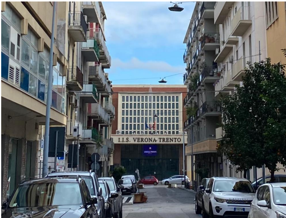
Figure 1. IIS Verona Trento

IIS Verona-Trento is one of the most advanced school in the entire Sicilian territory. Here are many specializations similar to those in our school – “Gheorghe Șincai” Technological High School: electronics, electrical engineering and automation, IT and telecommunications, mechanics, tourism technician etc.