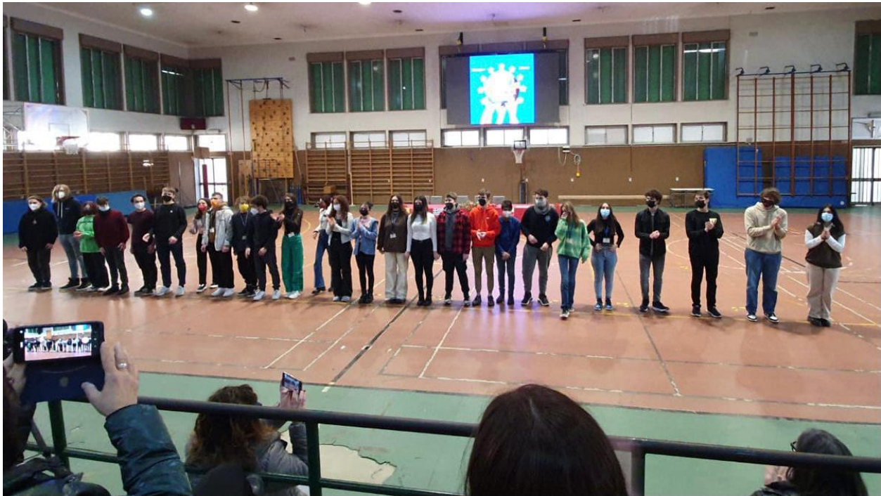
Figure 19. Group photo with all our friends

Both students and teachers really liked this the KA229 Erasmus+ School Exchange Partnership!