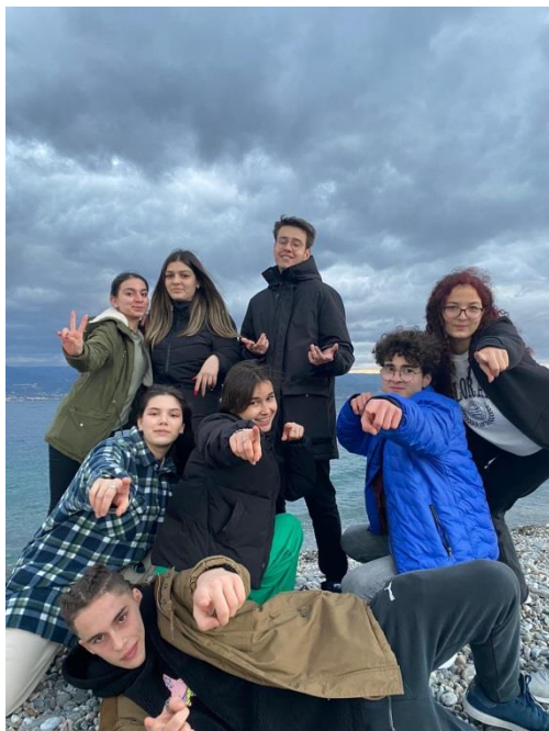
Figure 14. Having fun on the beach

The rest of the day we had free activities and a half of the group decided to go to the beach and enjoy the sunset near the sea.