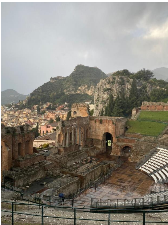
Figure 11. Tarmona Greek theatre

After we played in the snow and had a great time together on the volcano, we went in the beautiful medieval hill town – Taormina. Here we enjoyed unique views and, last but not least, we ate traditional Italian pizza. In the same day, we visited the Greek Theater, which is the most beautiful landmark from Taormina.