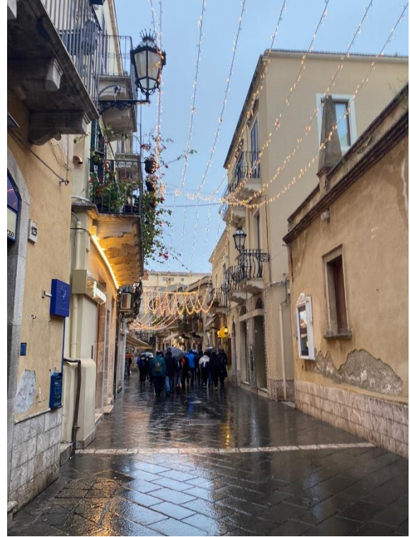
Figure 10. Taormina

After we played in the snow and had a great time together on the volcano, we went in the beautiful medieval hill town – Taormina. Here we enjoyed unique views and, last but not least, we ate traditional Italian pizza. In the same day, we visited the Greek Theater, which is the most beautiful landmark from Taormina.