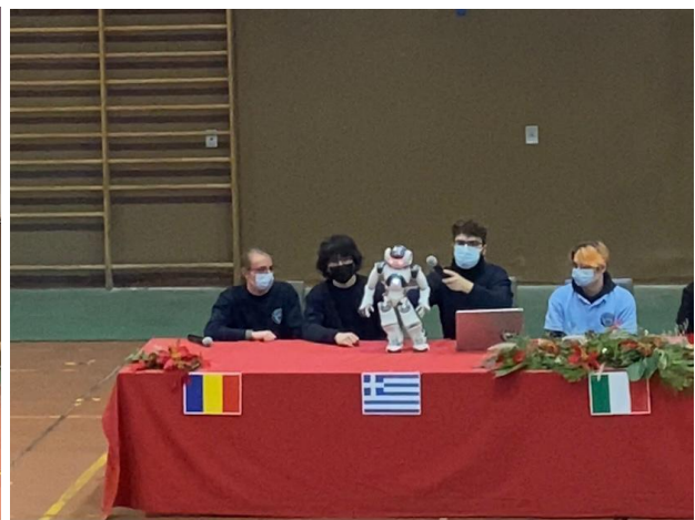
Figure 17. Meet the robot

This activity taught us a lot of things about other people, other nationalities and showed us that it does not matter how different we are, but the fact that we were there together. And together