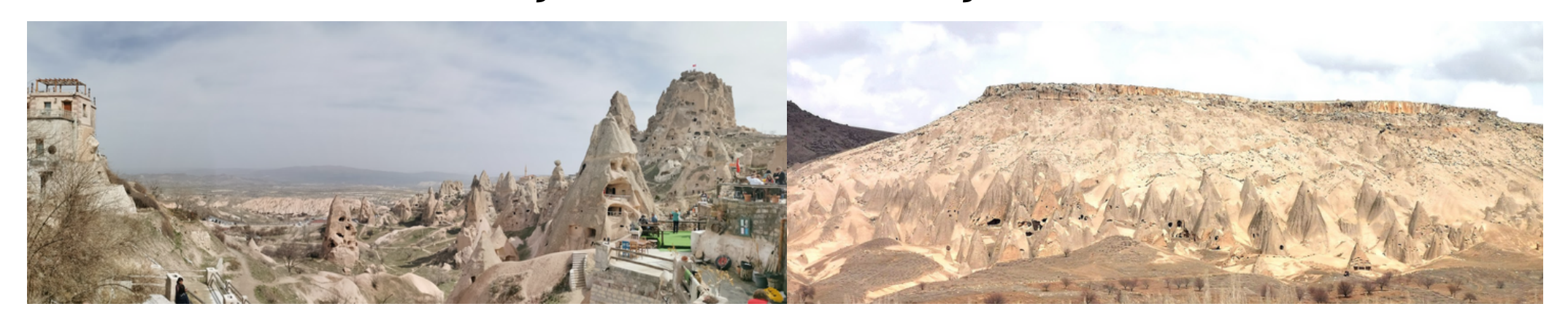
On the way of Cappadocia we visited the Salt Lake. We have a walk together in the Valley of Güvercinlik, learnt about the histort of the city from the professional guide and see the Fairy Chimneys.

This day we left to hotel to travel to Cappadocia which is located in Nevsehir. We wanted our quest to visit and discover the one of the unique landmark of the world. Cappadocia is the region that emerged when the soft layers formed by lava and ashes erupted by Erciyes, Hasandağı and Göllüdağ 60 million years ago were eroded by rain and wind for millions of years.