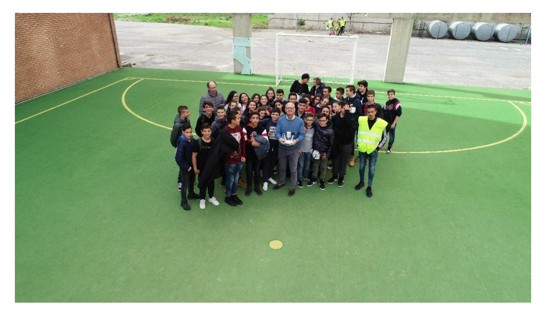
It seems it was a success!!!!!

It was a great opportunity for our students to improve their interpersonal relationship skills. They realized that they should not limit themselves to practice them with friends of the same age and that to facilitate good relationships, interpersonal relationship skills include being a good listener and communicating clearly.