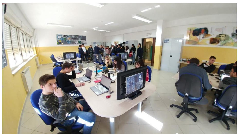
and showed them some devices