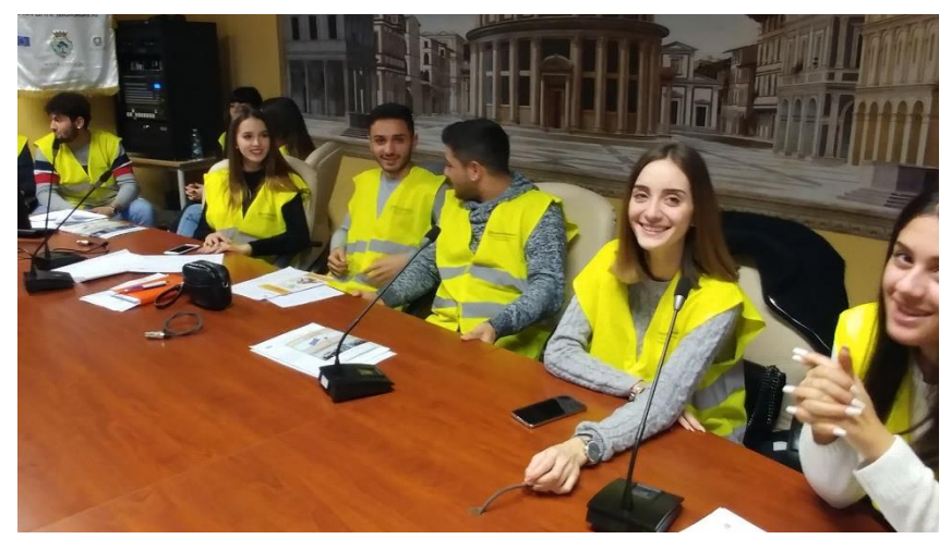
After a brief introduction of our school offer

Success in own's school orienteering usually requires a balance of curricula-specific knowledge and skills related to interpersonal relationships. Our institute decided to entrust students with this task. Teachers acted only as facilitators, so our students improved their soft skills both with the members of the management team and with younger students by trying to persuade them to attend our Institute.