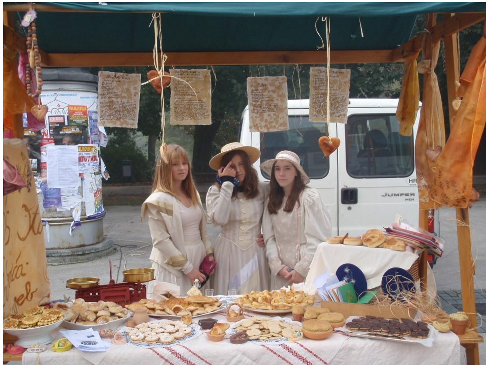
All the products of the school cooperative Oton are made based on the children's ideas and the students work on them together.