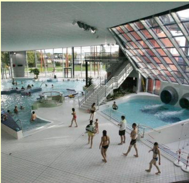
The Swimming-pool complex