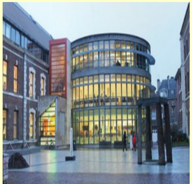
The multi-media library