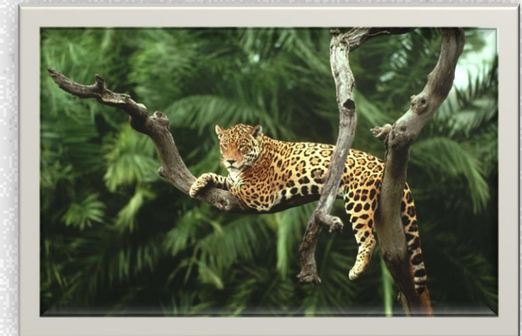
Amazon deforestation highest since 2006