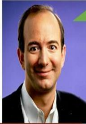
Jeff Bezos Amazon (1994)