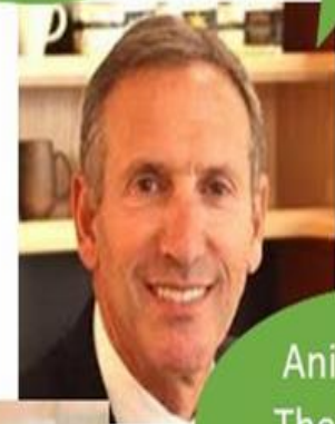
Howard Schultz Starbucks (1971)