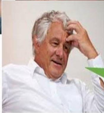
Hasso Plattner SAP (1972)