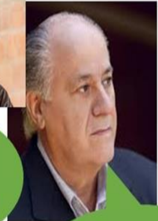
Amancio Ortega ZARA (1974)