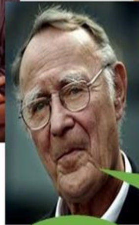
Ingvar Kamprad IKEA (1943)