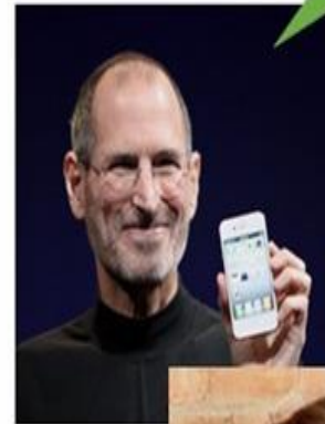
Steve Jobs Apple (1976)