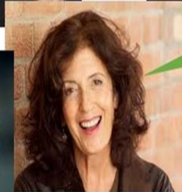
Ingvar Kamprad IKEA (1943)