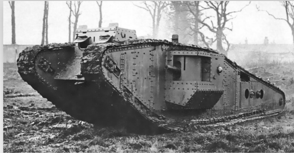
British Mark 1

British heavy tanks are the first massive produced tank vehicles on the world. They were a series of related armoured fighting vehicles. The mark I was the first tank tracked and armed armoured vehicle.