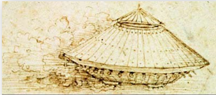
Leonardo Da Vinci project

Development of tanks was answer for changing war situation on the Western Front. Battlefield was becoming very hard, soldiers need something to force Barbed-wire fortifications.