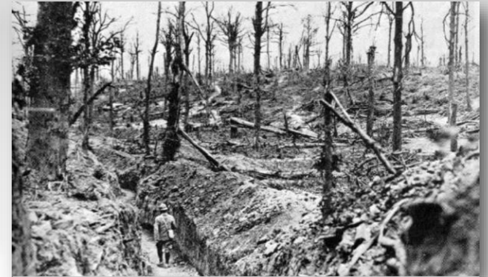
World War 1 Battlefield

France at the same time developed its own tracked AFVs, but the situation there was very different. In Britain a single committee had coordinated design, and had to overcome the initial resistance of the Army, while the major industries remained passive. Almost all production effort was thus concentrated into the Mark I and its direct successors, all very similar in shape.