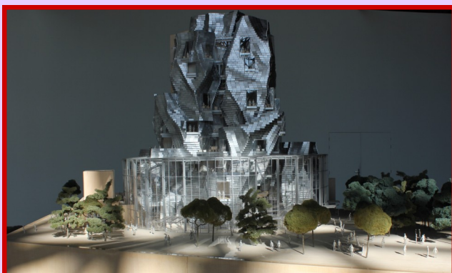
The human scale Tower model

tion regroups all kinds of arts and changes them very often. That's what makes it so special! There will be live archives, which is interesting since it will be an opportunity to see the entire work of the artist from its conception to the exhibition.