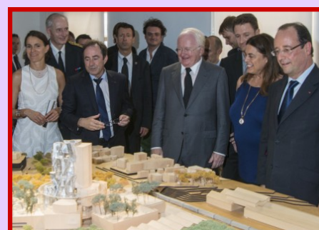
The Mayor, the Region President and the President of the French Republic

This project will probably have positive consequences on the local economy because they will employ inhabitants of the region to work in the tower and already have done so for the construction. They want this project to attract tourists all year round, which will have positive effects on the Arlesian economy. Moreover, the Tower will have a large air-conditioned exhibition room without any pillars which will be able to host both priceless and huge art works. This room will be unique in the South of France and the access will be free for Arlesians.