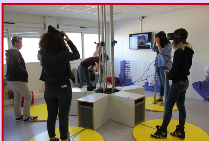
Virtual reality Visit

Even though the works are still in progress, Luma already involves new and contemporary artists in various fields. Eventually, the visitors will attend workshops, exhibits, gastronomy tastings, dance shows... But unexpectedly, it is not seen as a museum because the founda-