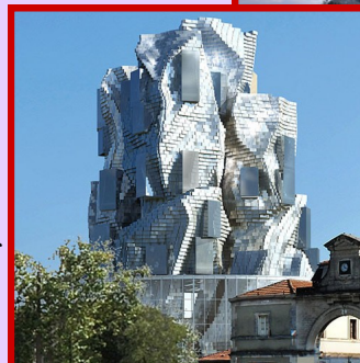
The Luma Tower