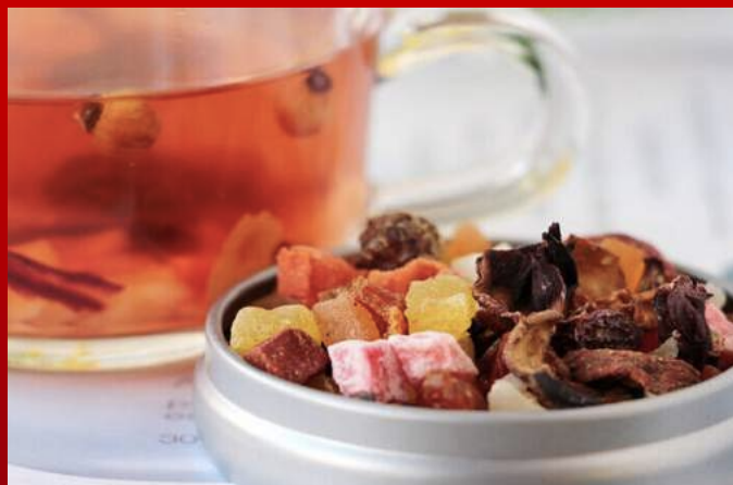
DRY FRUIT TEA