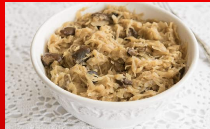
CABBAGE WITH MUSHROOMS