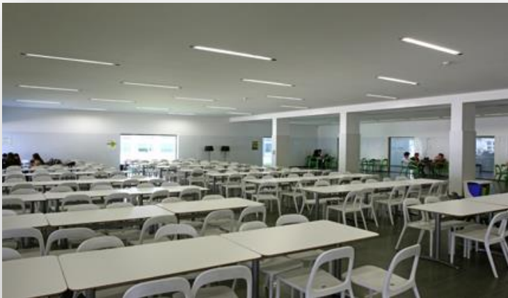
Canteen & Bar