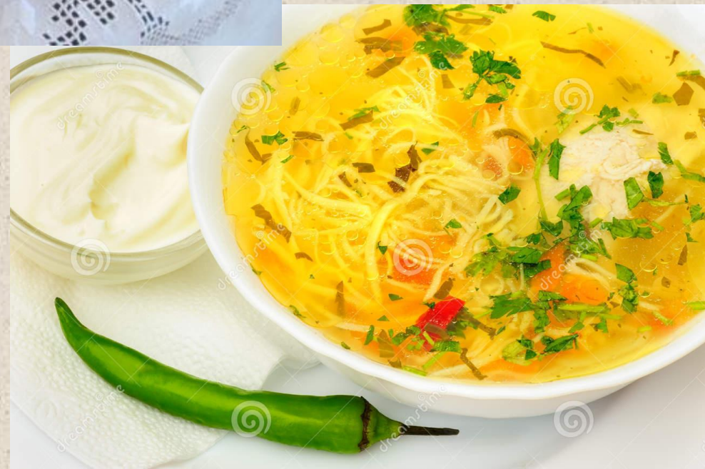
Traditional soup (zeama)