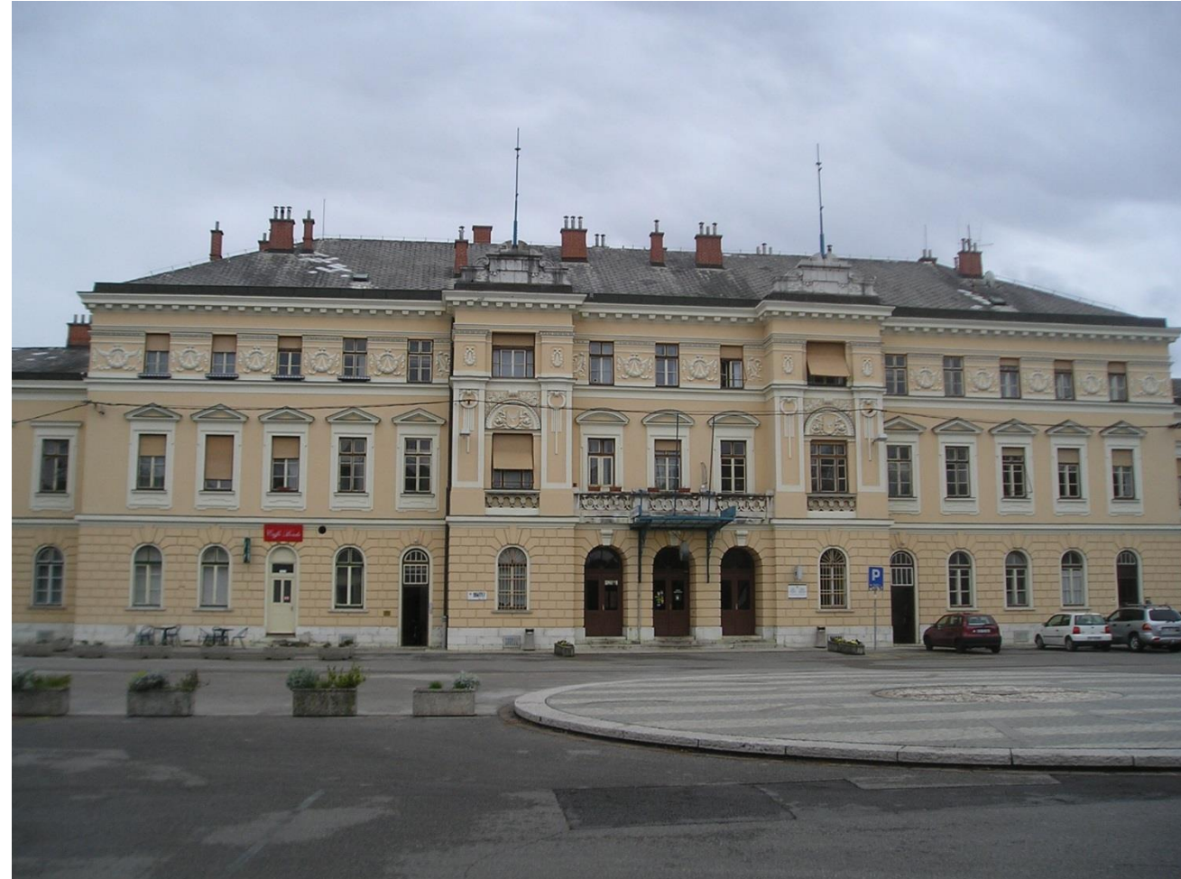
Nova Gorica is on the border with Italy. This is the square of Europe that connects both cities, Nova Gorica and Gorizia.