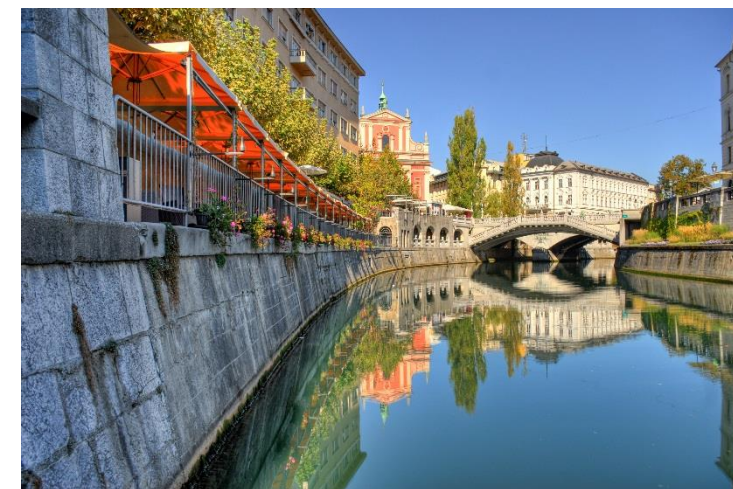
LJUBLJANICA (in Ljubljana)

In Sloveni there are many rivers. The longest river is Sava. Near our town Nova Gorica flows river Soča.