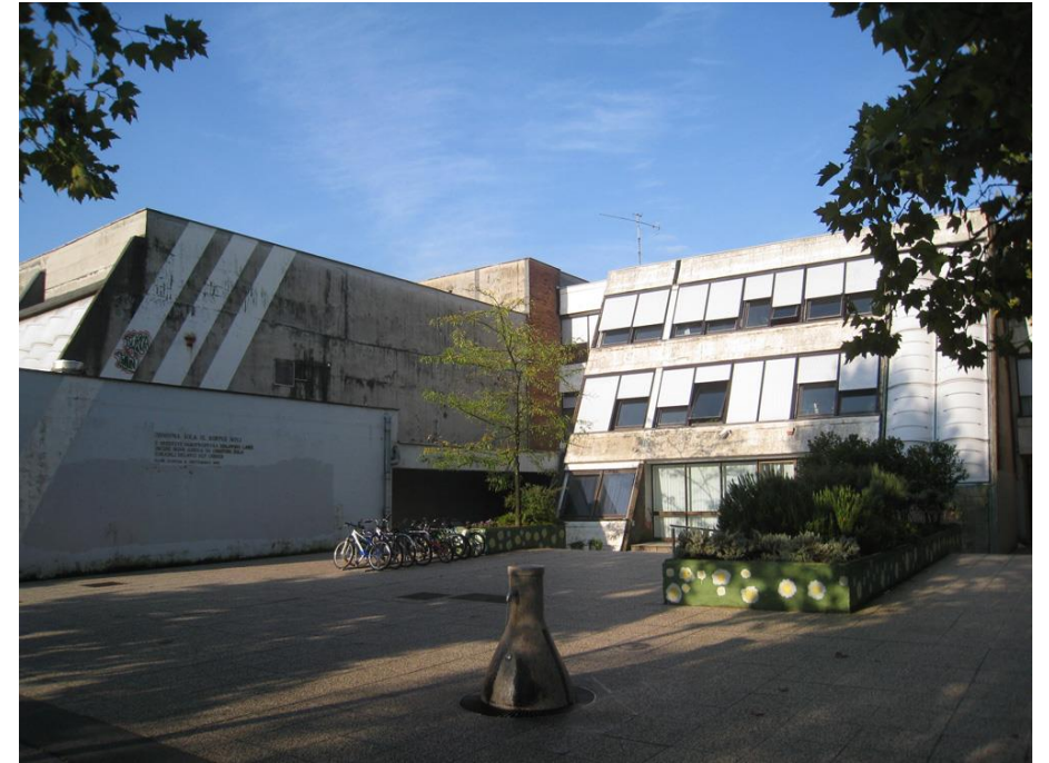
Fran Erjavec primary school

There are two primary schools in our city. Beside our primary school, Milojka Štrukelj, there is another primary school named after Fran Erjavec.