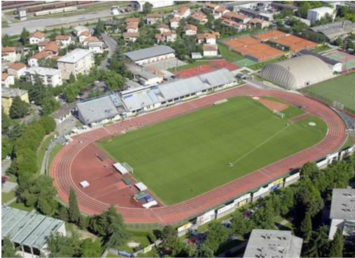
Football stadion in Nova Gorica