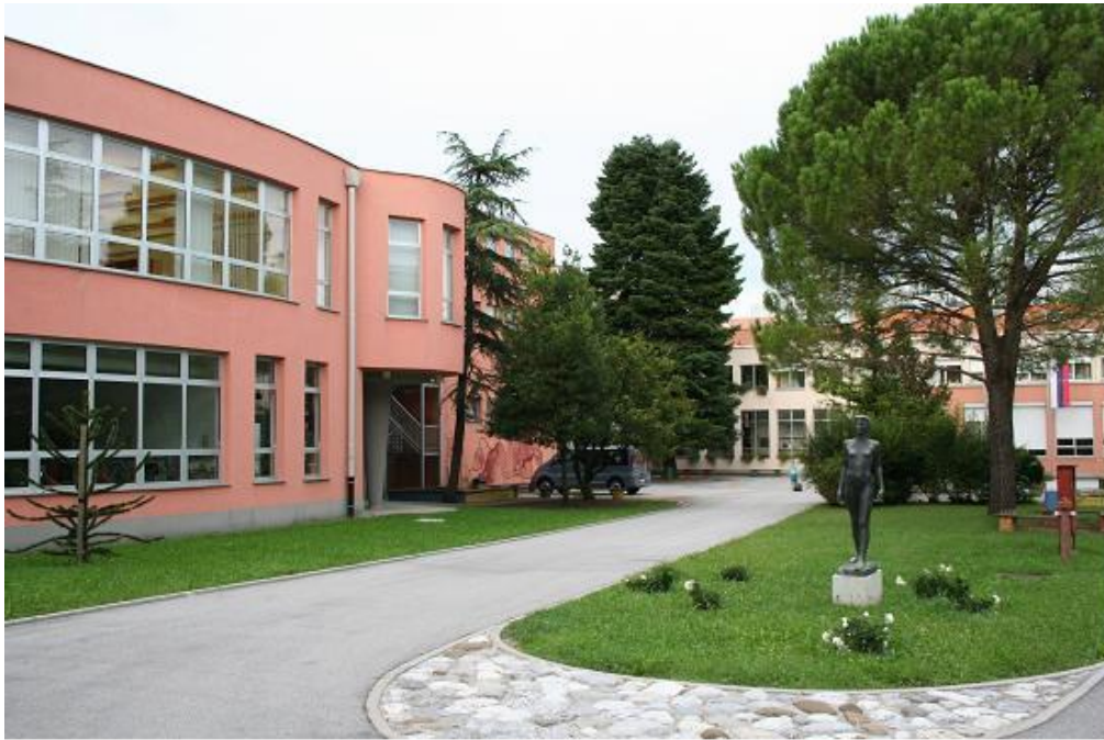
Milojke Štrukelj primary school