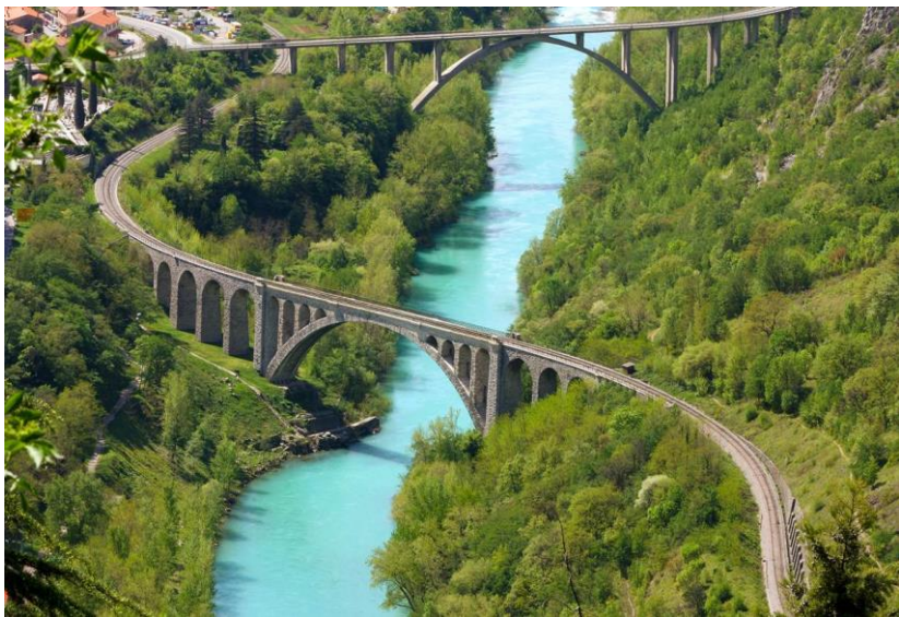
SOČA (in Nova Gorica)