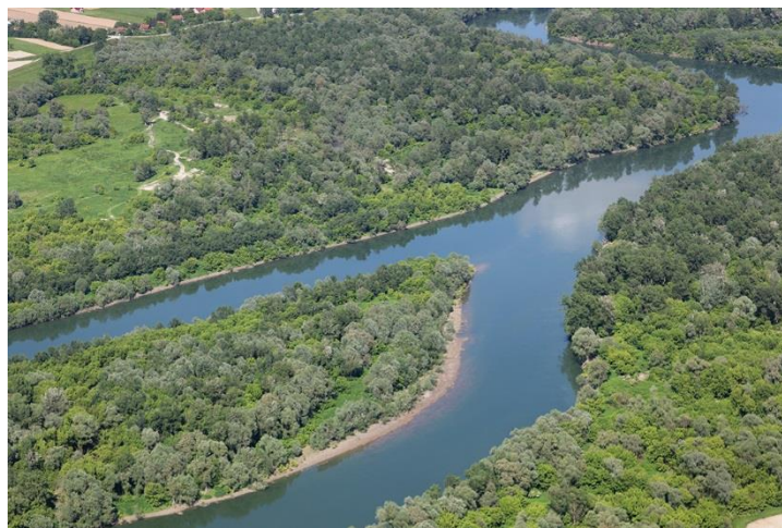
SAVA (in Kranj)