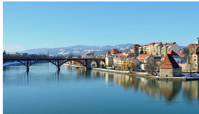
DRAVA (in Maribor)