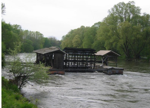
MURA (in Murska Sobota)