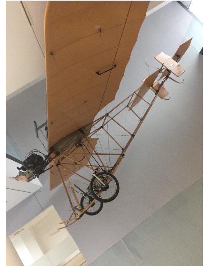
Edvard Rusjan (6.6.1886 – 9.1.1911)

Edward Rusjan was the first Slovenian flier. A copy of his plane is displayed in, and the monument is before the Eda Center.